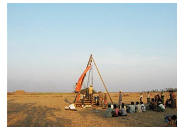
School Cum Cyclone Shelter Project,2009