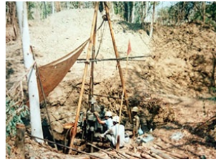
Htone Bo Project, Pyi Township ,2006