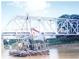
Myit Nge River Project ,2001