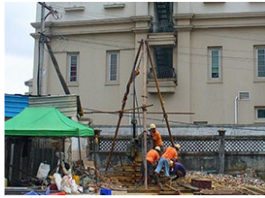
High Rise Building Construction Project,2012