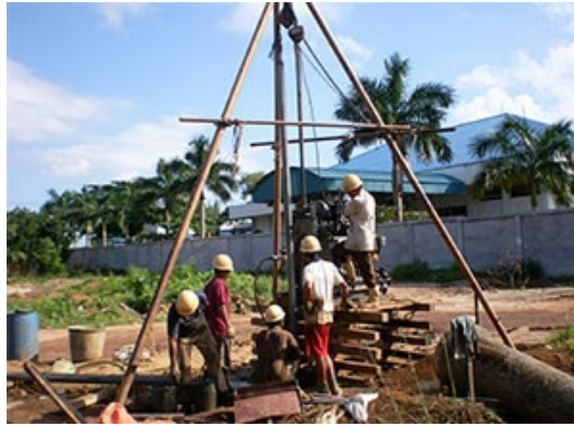
Parami Shopping Complex Project, 2010