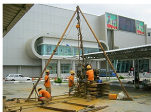
Junction Square Project Yangon Region,2012