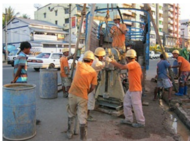
Tamwe Junction Project Yangon Region,2012