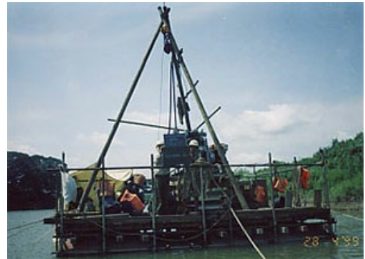
Railway Bridge Project, Donthami River, 1999