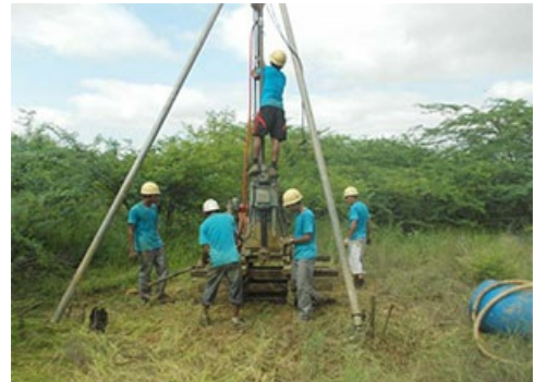
Mandalay International Airport Project,2013