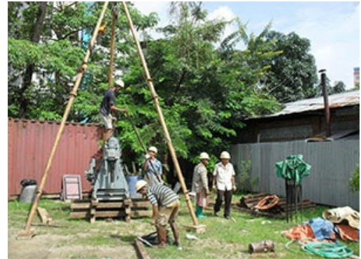
Central Condominium Project Yangon Region,2011