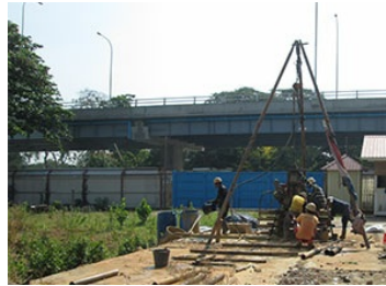
AMC Tower Project Yangon Region,2013