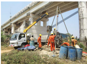
Gying River Project Kayin State, 2014