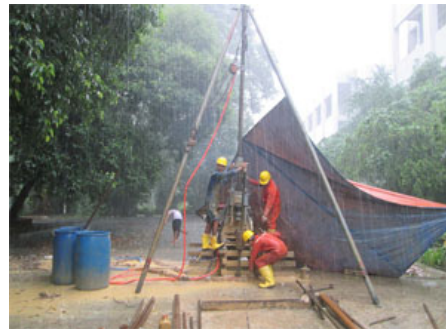
Yangon Museum Development Project ,June 2015