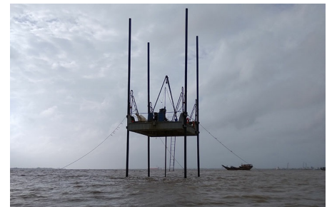
Grain Terminal Project(Offshore Area),July 2017 with Penta Ocean Construction Co.,Ltd