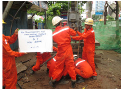
Myaynigone Flyover Bridge Project Yangon Region,2014