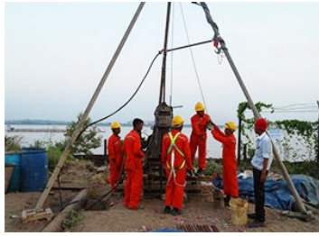
Jetty Construction Project,2013