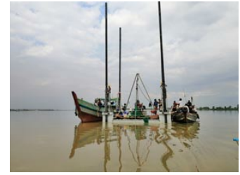
Soil Investigation at