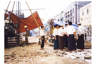
Shwe Pwar Gyi Project, 2003