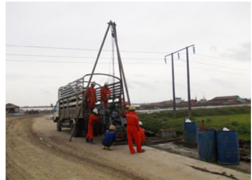
New Tharketa Bridge Project ,2014