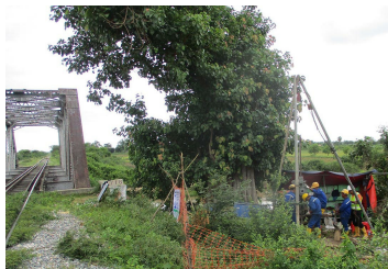
Yangon~Mandalay Railway Phase II, June 2017 with Oriental Consultant Global