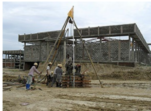
Ruby Hall (National Guest House) Project,2011