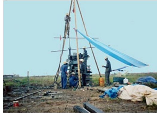
Spinning Factory Project, 2000