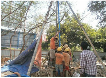
Junction Square Project Yangon Region,2013