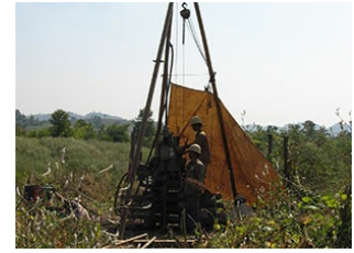
Taung Dwin Gyi Project, 2007