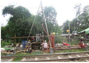
Yangon Circular Railway Project,2014