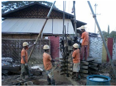
3 Storey Building Consturction,Pyinmana Township,2011