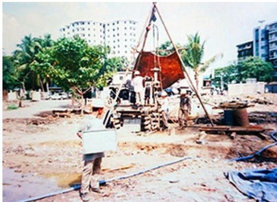
Soil Investigation for Construction of Condominium at Hledan Center, 2003