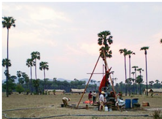
230 KVA Transmission Line Chindwin River Crossing Project,2009