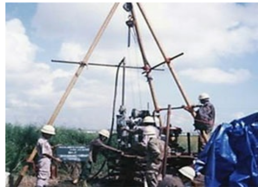
Asia Optical Factory, Mingalardon Industrial Park Project,2002