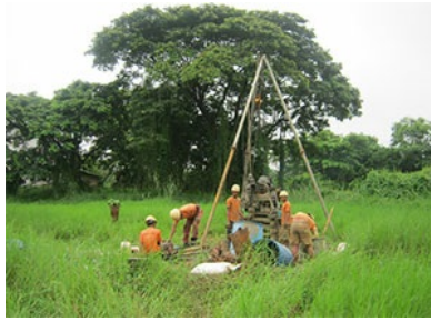
Tharketa Supply Base Project,2012