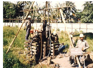
Ngwe Toe Pwar Project ,2003