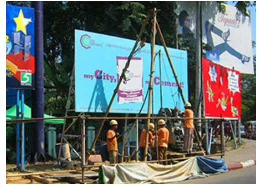
Yangon ~ Pyay Elevated Way (Hledan Junction),2012