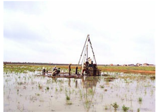
Oil Firm Construction Project,Thilawa ,2011