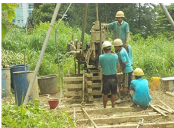
National Library Project Yangon Region,2013