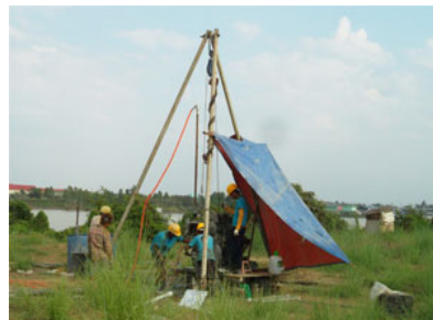
Shwe Linban Project Yangon Region, 2014