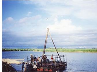
Myanma Railway Project, Donthami ,2000