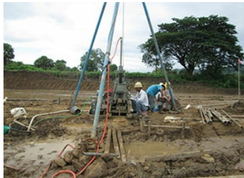
Salin Chaung Project,2013