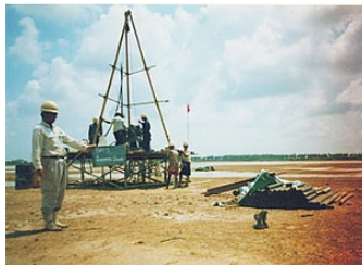
Bulk Cement Terminal, Thilawa , 1998