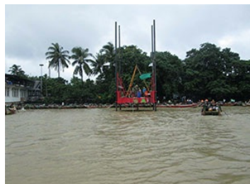
Pansoedan Jetty Project Yangon Region,2013