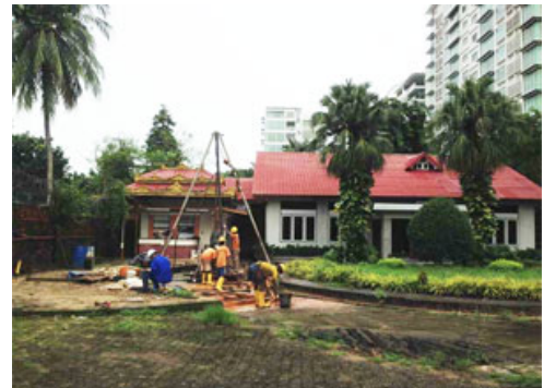
Super Seven Star "SSS" Car Showroom Project ,2014