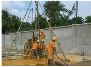
Royal Rose Condominium Project Yangon Region,2011