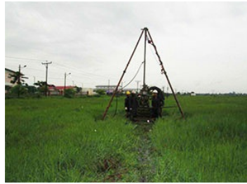
Mingalardon Industrial Park MIP A13 ,2013