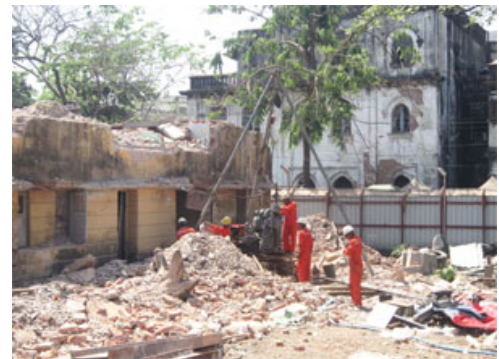
High Rise Building Project, Botahtaung Township Yango Region, 2014