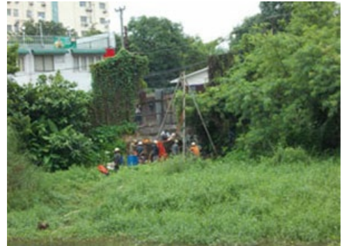
High Rise Building Construction Project Yangon Region,2013