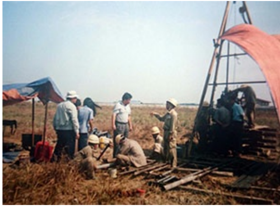
Nibban Electric Factory, 2003