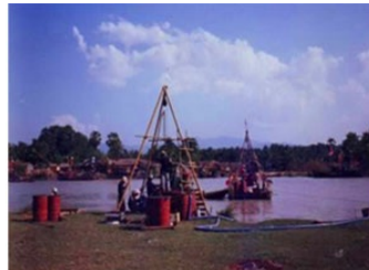
Bulk Cement Terminal, Thilawa , 1998