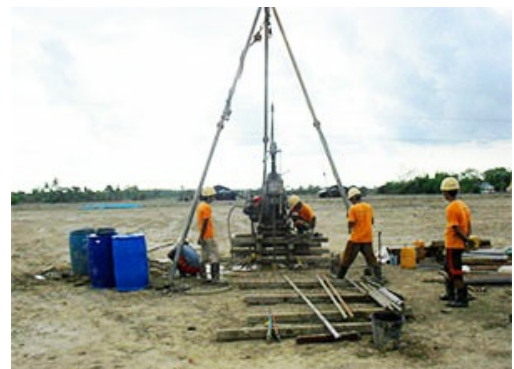
Construction of Factory and Cement Warehouse (Near Mya Sein Yaung Creek Project),2012