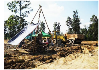
Magway Caustic Factory Project, 2010