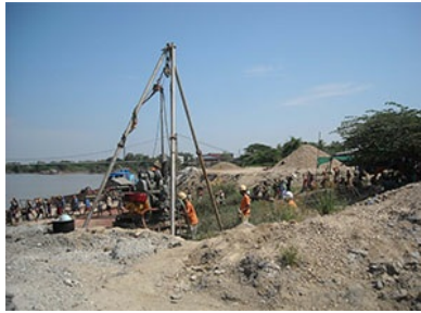
River Bank Protection, Nga Moe Yeik Creek Project Yangon Region,2011