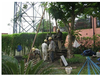
German Embassy Project,2008