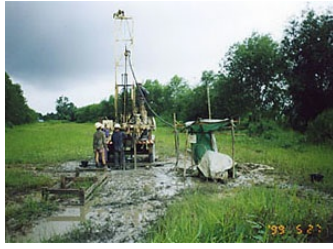
MANI Factory Project ,1999