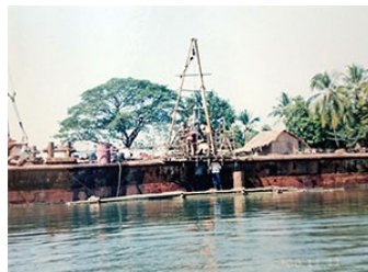
Myit Nge River Project ,2002