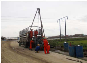
Dagon Seikkan Project Yangon Region,2014