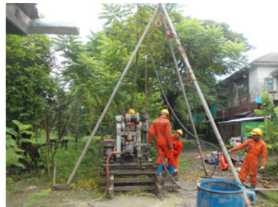
MPA Residence Construction Project,2014