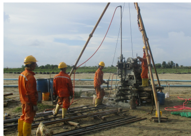
Grain Terminal Project(On Land Area),July 2017 with Penta Ocean Construction Co.,Ltd