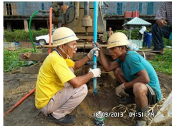
PME Tower Construction,2013