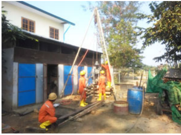
High Rise Building