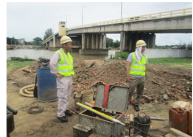
Soil Cement Mixing Test, August 2015