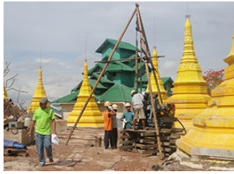
Danote Pagoda Project, 2010