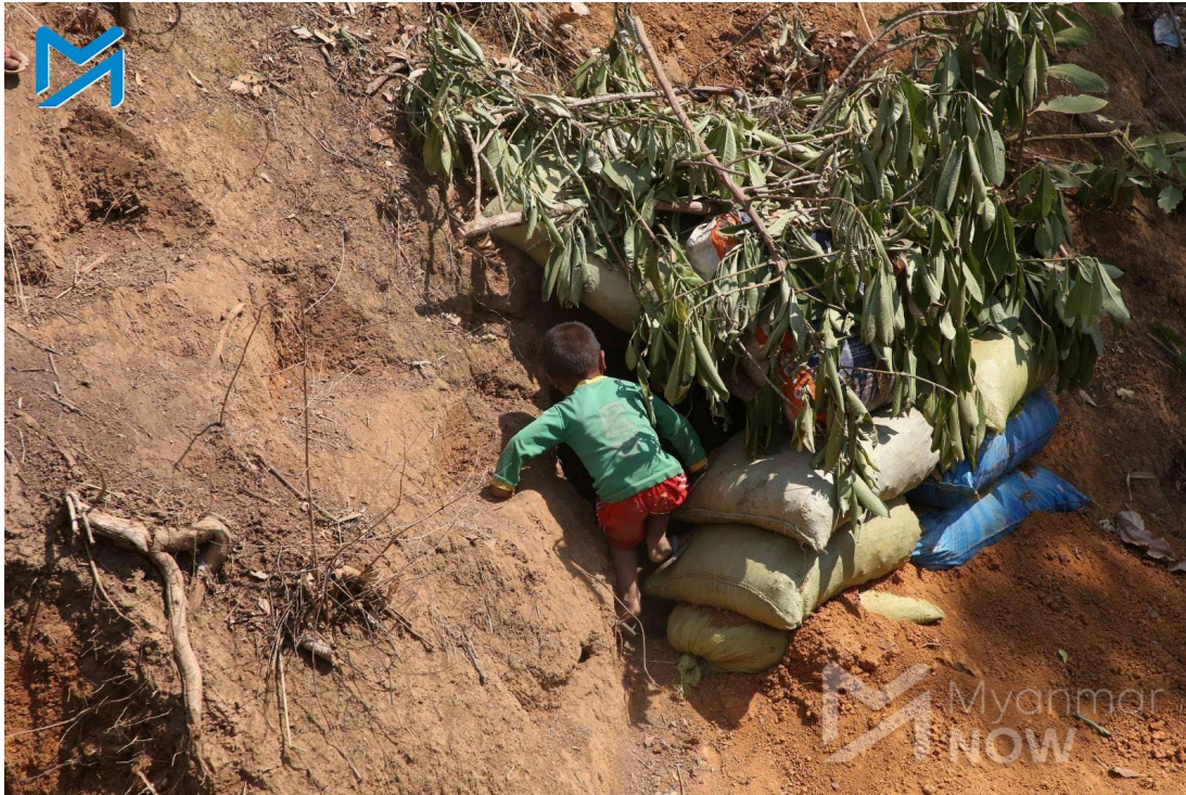
Figure 13 Children entering a bomb shelter. Cutting off aircraft fuel is important so that air strikes will stop.