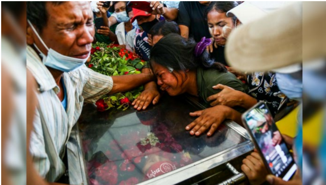
Figure 16 Grieving family of a slain protester. Hundreds have been tortured and killed. This family was lucky to get the body back for proper burial. Please see AAPP | Assistance Association for Political Prisoners (aappb.org) for the latest statistics.