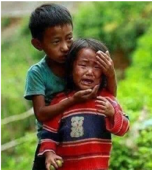
Figure 6 An IDP child comforting his sister