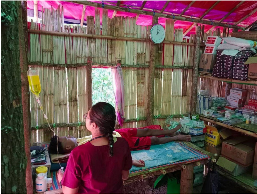
Figure 7 A jungle medical clinic