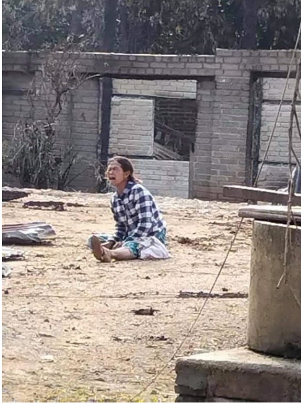
Figure 11 A woman grieving the loss of her home. Cutting off aircraft fuel is important so that air strikes will stop.