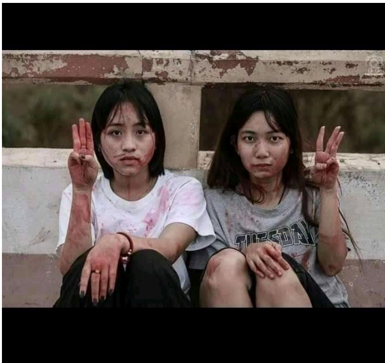
Figure 14 Arrested young women still defiant. Please see AAPP | Assistance Association for Political Prisoners (aappb.org) for the latest statistics.