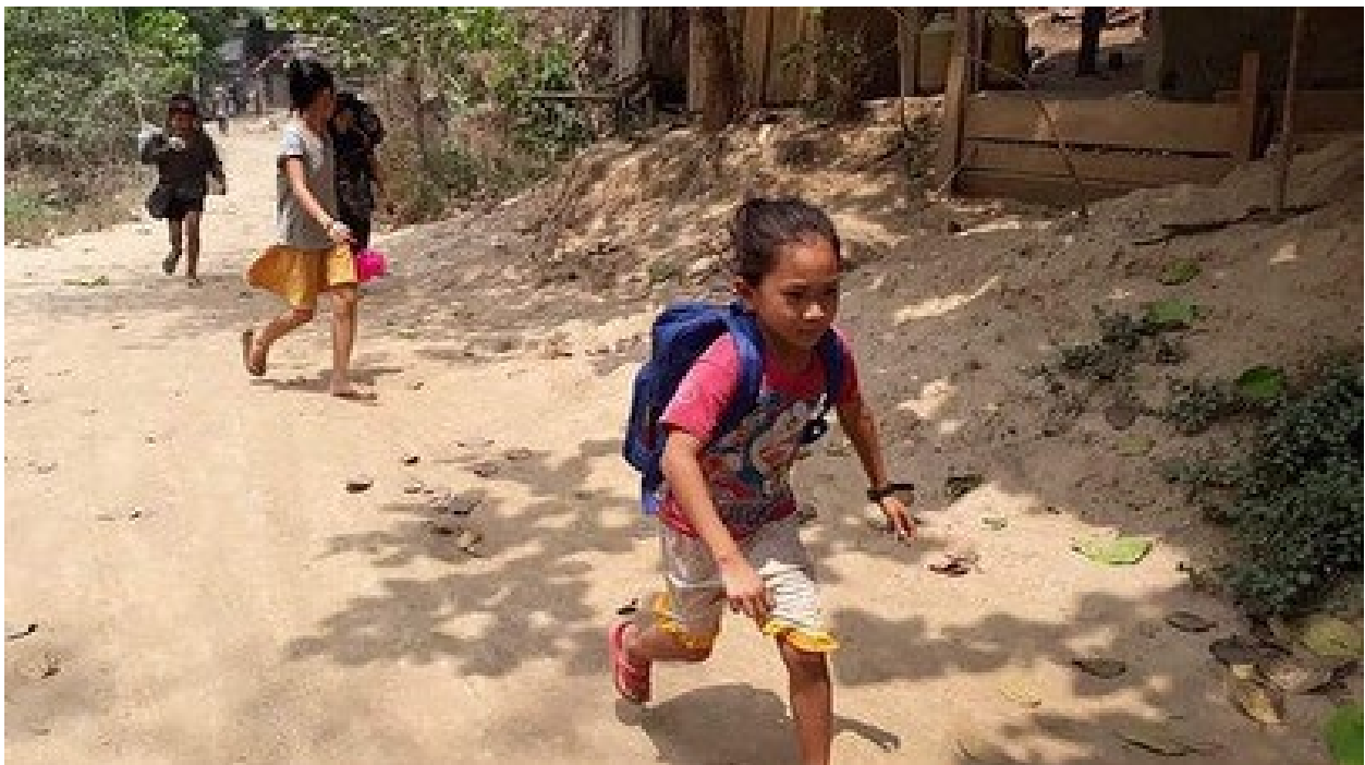
Figure 12 Children fleeing an air strike. Cutting off aircraft fuel is important so that air strikes will stop.