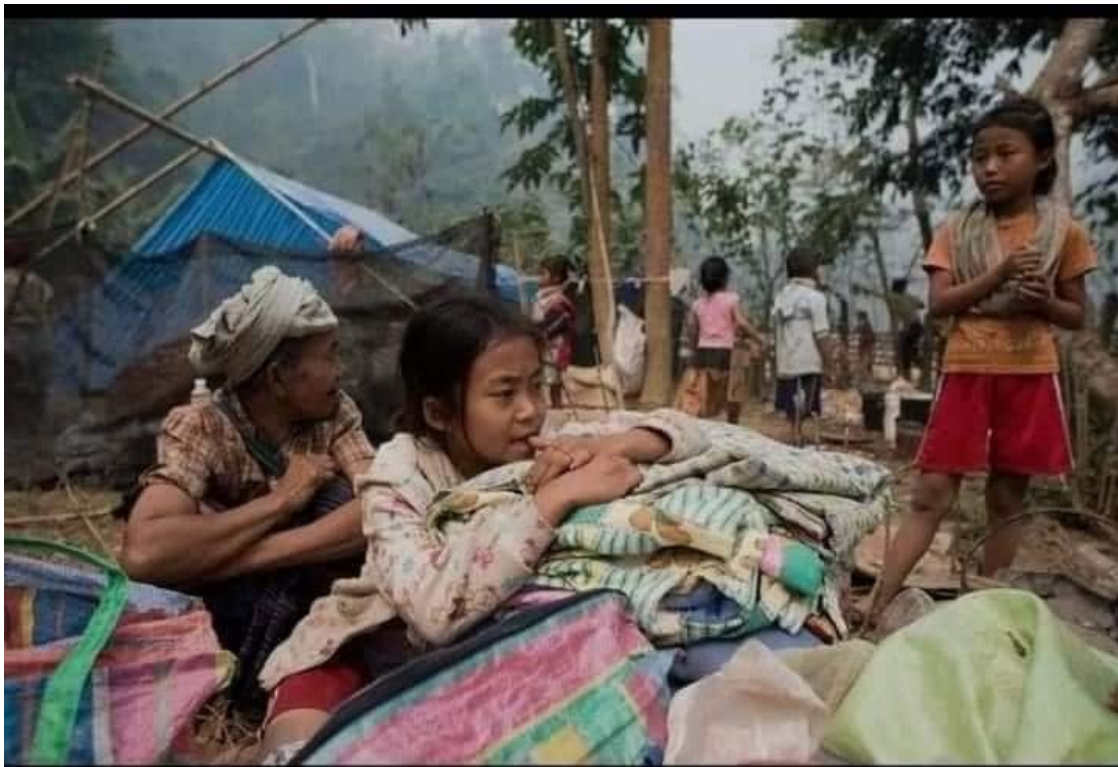
Figure 4 Inside an IDP Camp