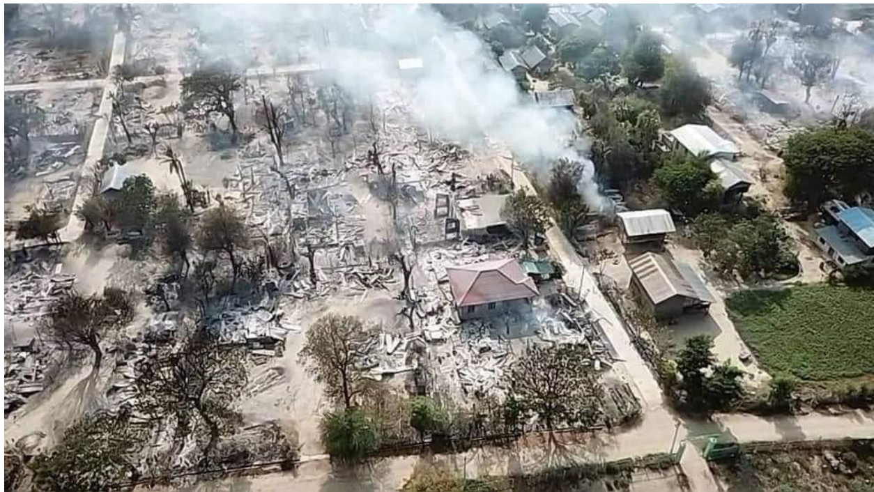
Figure 2 A village in central Burma called Inn Ma in the Chaung Oo Township which was burned to the ground by the Burmese military on April 24, 2022. People's lives are being destroyed with impunity just because they dare to think about freedom. Cutting off aircraft fuel is important so that air strikes will stop.