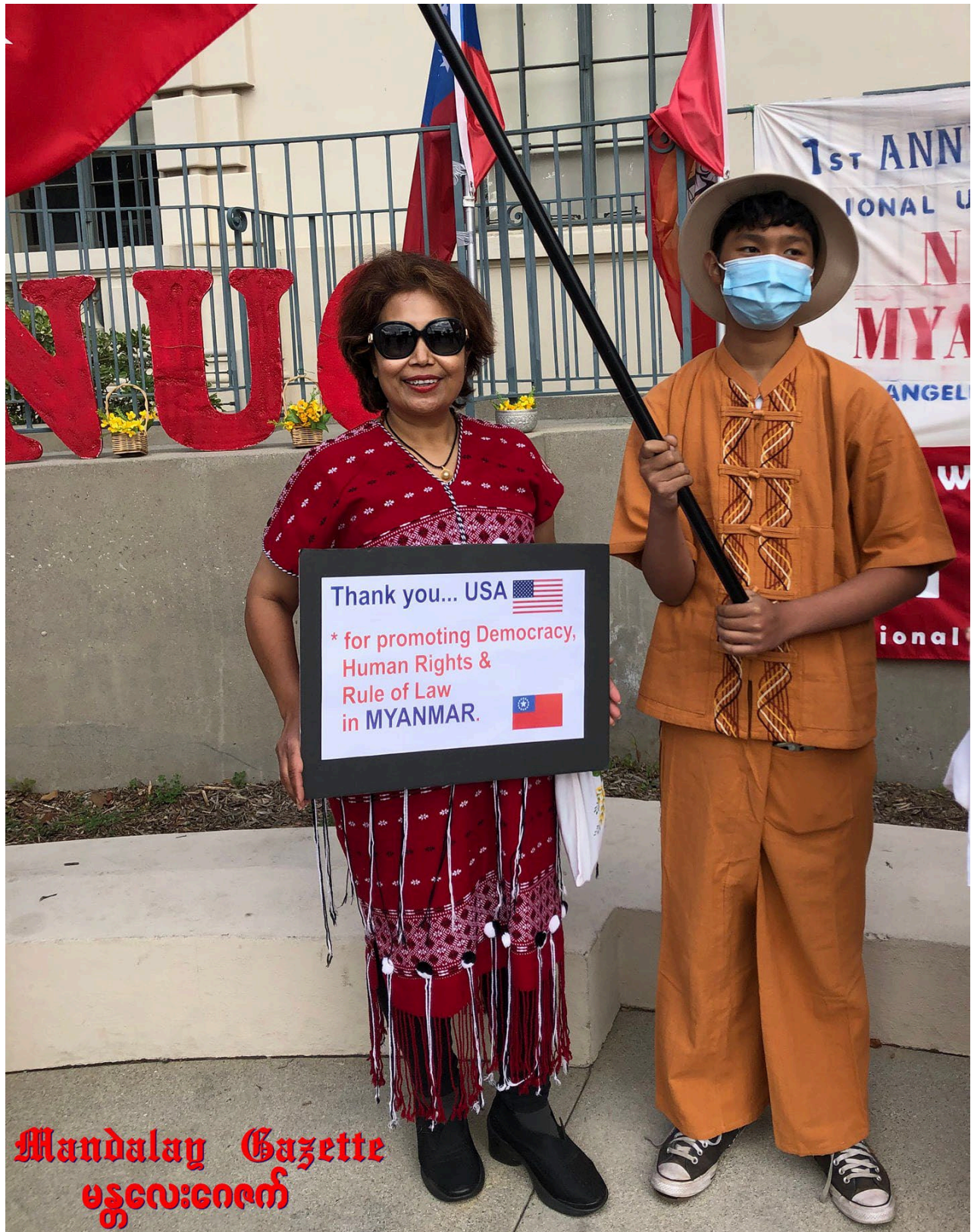
Figure 19 Burmese Ethnic Minorities Rally in California