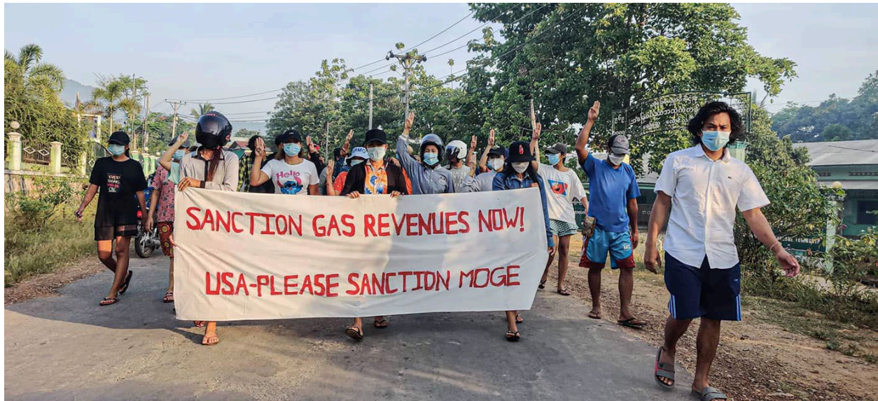
Figure 1 Burmese youth -Southern Burma - risking their lives just to rally – driven by their strong belief that the U.S. could help. Please don't let them down. https://www.business-standard.com/article/international/myanmar-public-urges-gas-sanctions-to-stop-military-funding-amid-violence-121121500361_1.html