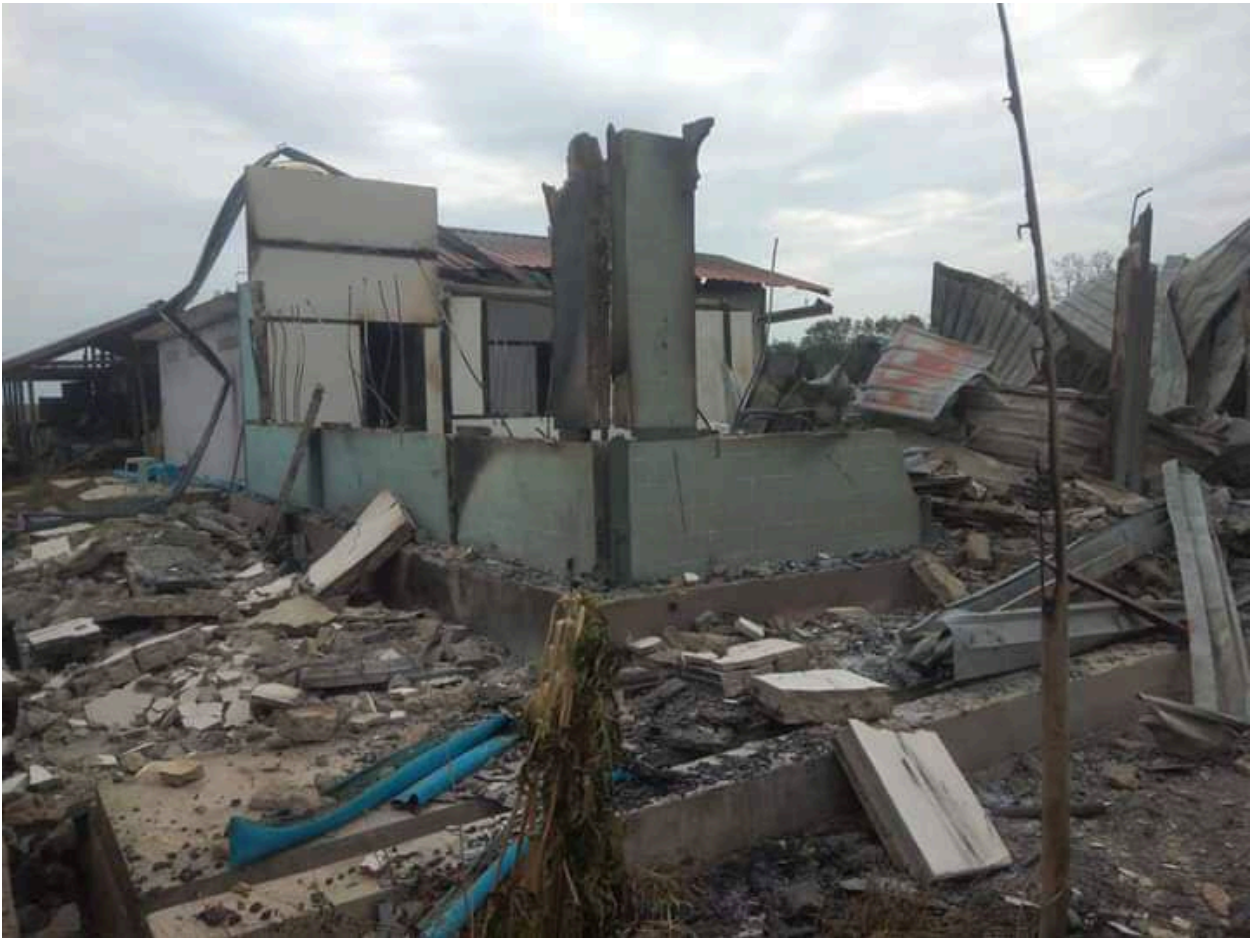
Figure 10 Aftermath of a bombing. Cutting off aircraft fuel is important so that air strikes will stop.