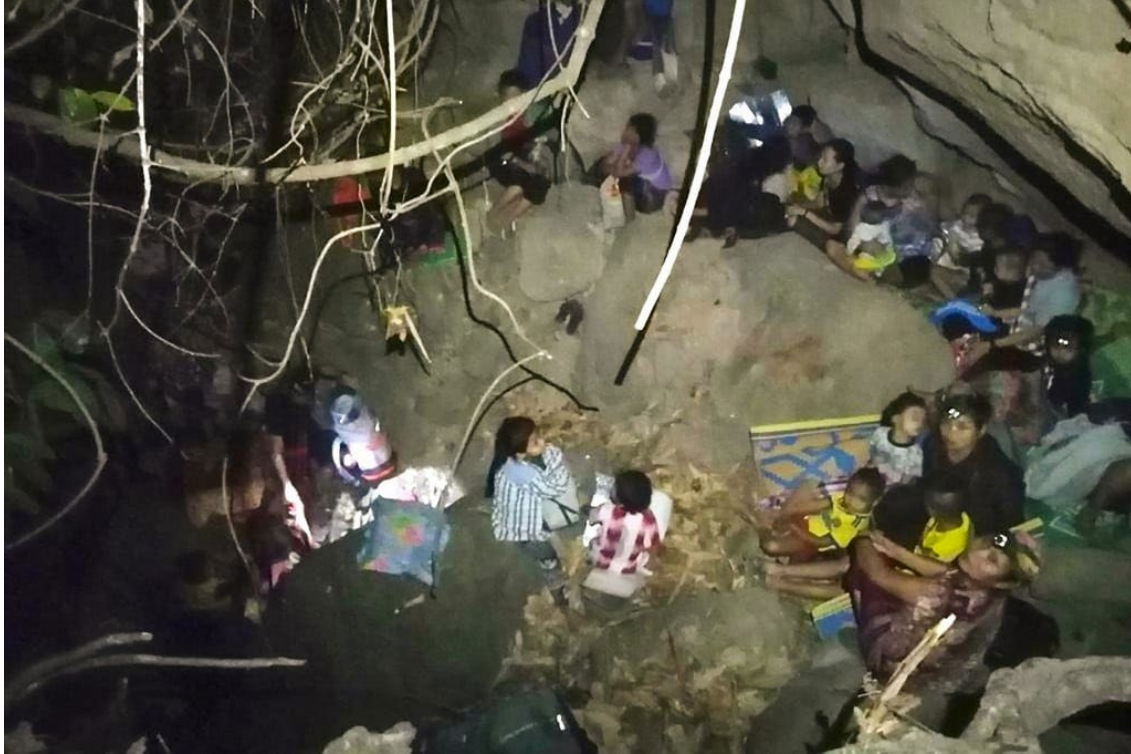
Figure 3 Residents from the Day Pu No village hiding in the jungle, north of Hpa-pun in eastern Myanmar's Karen state after the area was hit by air strikes late on March 27