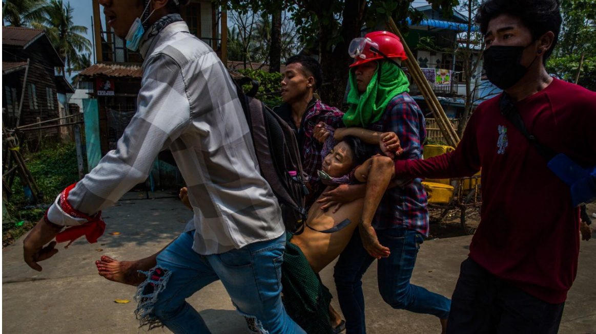
Figure 17 A shot protester being carried to safety. Please see AAPP | Assistance Association for Political Prisoners (aappb.org) for the latest statistics.