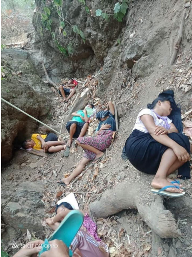
Figure 5 How IDPs sleep