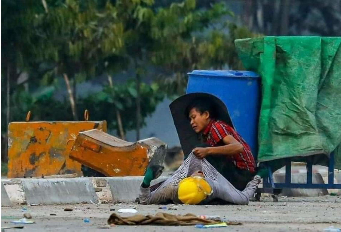
Figure 15 A protester grieving his shot friend. Please see AAPP | Assistance Association for Political Prisoners (aappb.org) for the latest statistics.