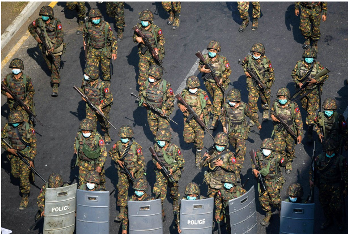
Figure 18 The military in full combat gear marching towards the protesters