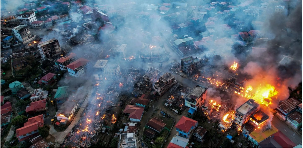
Figure 9 A bombed city in Chin land. Cutting off aircraft fuel is important so that air strikes will stop.