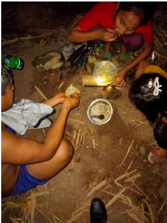
Figure 8 How IDPs eat