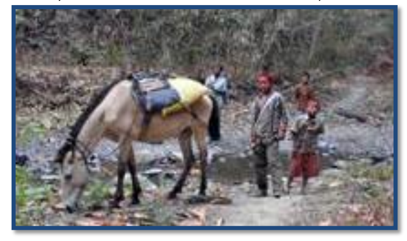
Rice traders traveling from Chin State, Burma to Mizoram, India in order to purchase rice to bring back to remote villages to sell for a profit.

needed food supplies.<sup>27</sup> Eighty-five percent of people in Chin State are reportedly in debt to local moneylenders after taking on loans to purchase food.<sup>28</sup> Rice traders have similarly set up businesses purchasing large amounts of rice in Mizoram and transporting it to remote villages in affected areas of Chin State to sell to hungry villagers. As most villagers are unable to pay for the rice outright, traders have established predatory lending schemes that require villagers to repay double to triple the cost of the rice received as a penalty for delayed payments.<sup>29</sup>