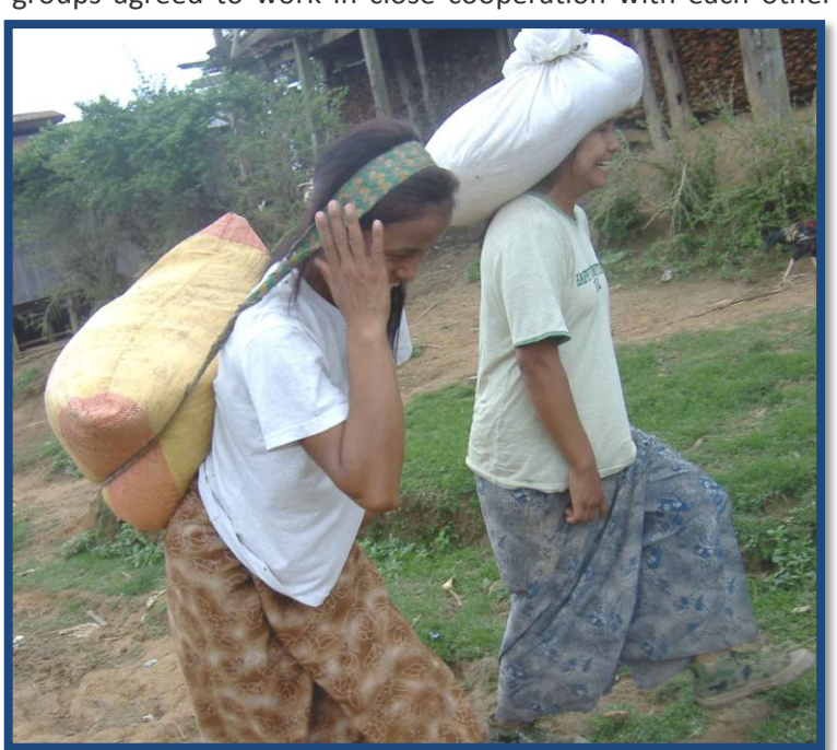
Chin women carrying food aid provided by community-based relief teams back to their villages.

Public Affairs Committee of Chinland (PAC), and the Women's League of Chinland (WLC).* Under the terms of the Memorandum of Understanding (MoU) signed by each member of the coalition, the four groups agreed to work in close cooperation with each other to effectively provide food aid relief to