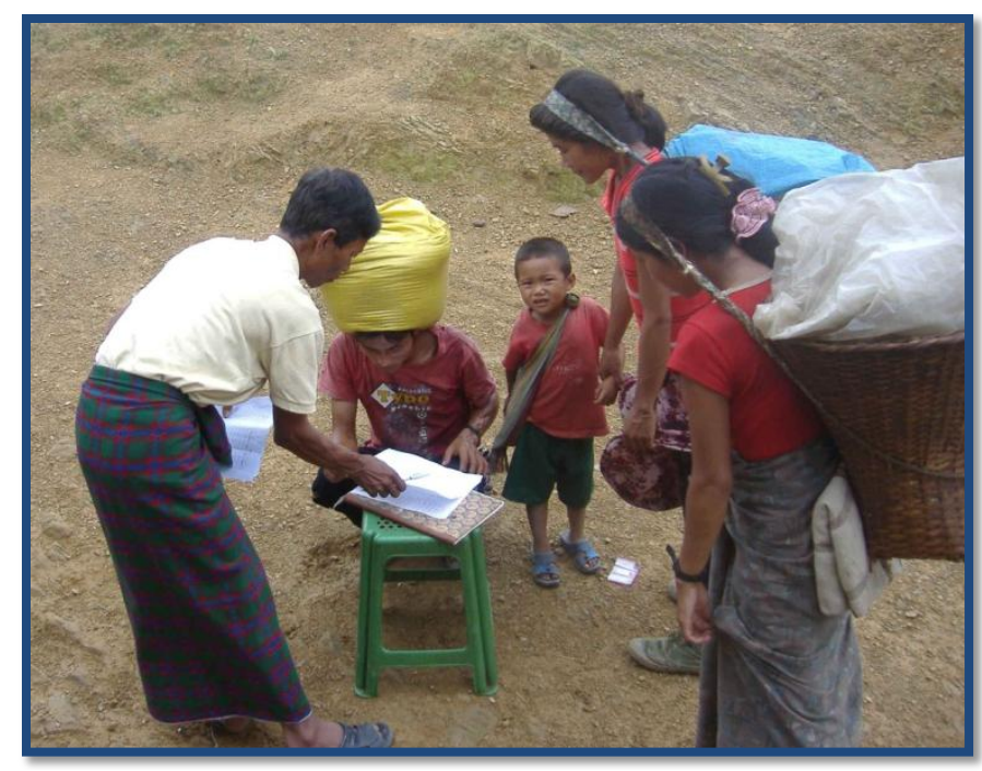
Villagers signing for food aid being delivered by community-based relief teams.

immediate action. civil society groups based in Mizoram began organizing committees to respond to the developing food crisis in Chin State as early as late-2007, with relief teams providing aid to affected areas as early as March 2008. Recognizing the need to develop a coordinated approach comprehensive strategy to effectively respond to the crisis, four groups came together to form a coalition in October 2008. These groups include the Chin Famine Emergency Relief Committee (CFERC), the Chin Humanitarian Relief Committee (CHRC),