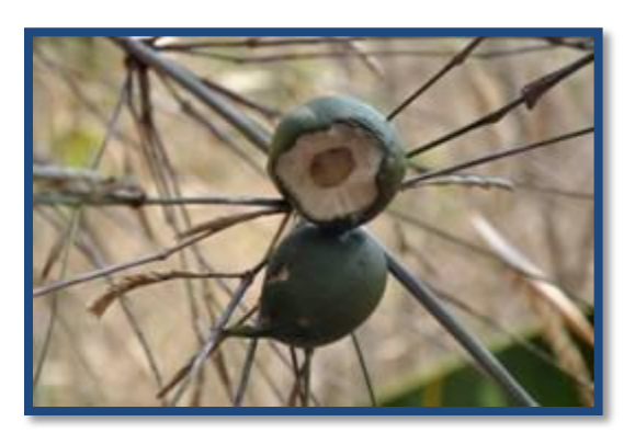
When the bamboo flowers it produces a large fruit, attracting rats who eat the fruit and multiply in vast numbers.

In the context this intense human rights environment, conditions in Chin State reached a critical point when the bamboo began to flower in early 2006. The bamboo that covers approximately one-fifth of Chin State is called Melocanna baccifera , and as part of its regeneration process, it flowers and dies every 50 years. When the bamboo flowers it produces a fruit. Rich in nutrients, the fruit attracts forest rats that feed on the fruit and reproduce at a rapid rate. When the fruit supply is exhausted, the rats turn on people's farms and fields-