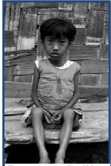
Villagers are now struggling with hunger and severe malnutrition due to food shortages in Chin State. Children are particularly at risk of malnourishment.

The bamboo of Chin State began to flower in late 2006. Attracted to the fruit produced by the bamboo, the flowering process triggered an explosion in the rat population. After exhausting the fruit supply, the rats turned on people's crops and food supplies, causing massive food shortages for local villagers dependent on farming for their livelihood and subsistence. In 2008, CHRO estimated that as many as 200 villages were affected by severe food shortages associated with the bamboo flowering, and no less than 100,000 people, or 20 percent of the entire population of Chin State, were in need of immediate food aid. CHRO now believes those figures are much higher.