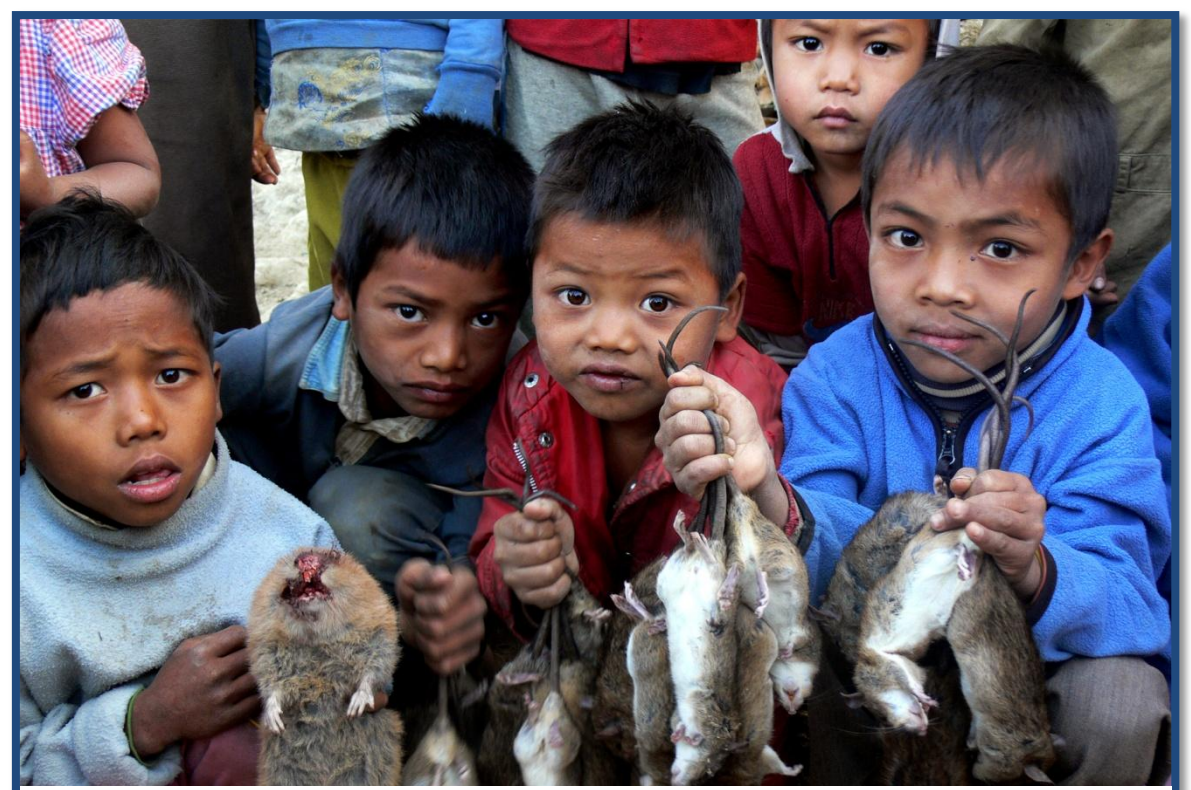
Chin children holding rats captured and killed around their village. The rat population has increased in recent years as they feed on flowering bamboo fruits and multiply in ever-expanding numbers. The rats are largely responsible for the current food crisis in Chin State, causing havoc on farmer's fields and villager's food supply.

This report is based on information provided by relief teams based along the India-Burma border who are providing food aid and assistance to affected areas in Chin State, Burma. The data was collected from more than 80 villages within affected areas in six townships of Chin State over an 18-month period between January 2008 and August 2009. Interviews were conducted in various Chin dialects and translated into English later. As many interviewees may be subject to reprisals in Burma, CHRO has withheld their names and identifying information.