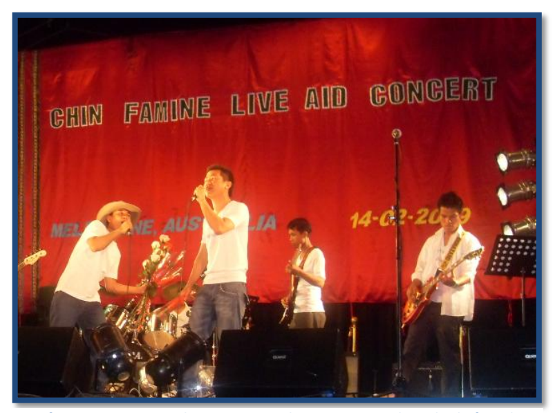
Benefit concert in Australia to support Chin community-based relief workers. Similar concerts have been held around the world to support community-based initiatives.

concerts have been held or are scheduled to be held in Thailand, Malaysia, Singapore, Australia, various cities in the U.S., the U.K., Norway, Denmark. 113 The and Germany, proceeds from these concerts support relief teams based in Mizoram. A concert was also held in Thantlang Township in October 2008 to raise funds for a Burma-based civil society group called the Mautam Relief Program (MRP). With the proceeds from the concert, MRP coordinated relief teams to supply aid to affected areas in Falam and Tiddim Township in late 2008. 114 MRP has since been working closely with CFERF to deliver aid to areas in Thantlang Township. 115