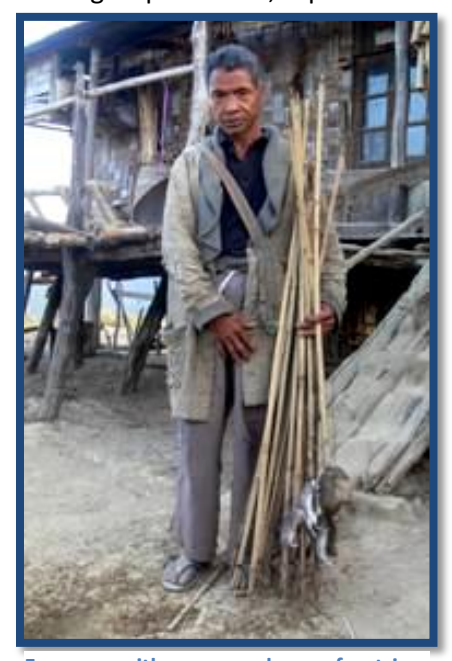
Farmer with a number of stringtriggered traps. Farmers lay up to 70 traps in and around their farms and fields to catch and prevent rats from entering their fields.