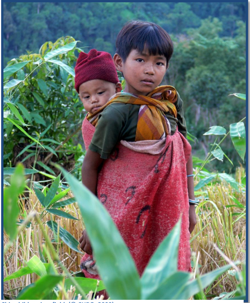
Chin children in a field.