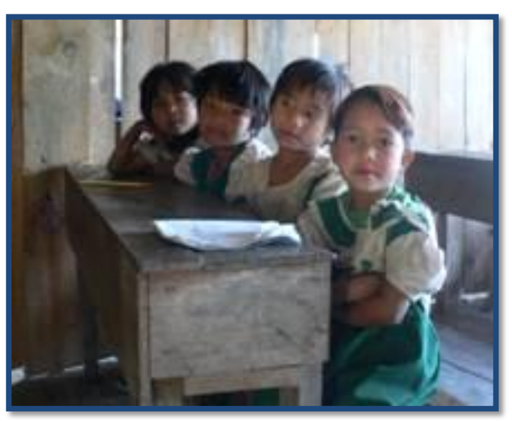
School enrollment and attendance rates have fallen significantly due to severe food shortages. Some schools have closed and others have limited class time. (© CHRO, 2009)

Parents can simply no longer afford to send their children to school when there is no food left to eat at home. <sup>68</sup> School enrollment and attendance to severe food shortages. Some so limited class time. (© CHRO, 2009)