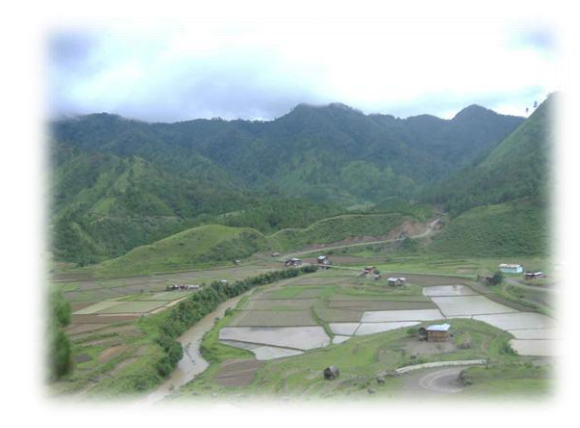
Landscape of Chin State, Burma.

In addition to severe economic and social repression in Chin State, the Chin people struggle for survival in a hostile human rights climate. The ruling military regime of Burma, the State Peace and Development Council (SPDC), routinely uses tactics of terror and brutality to control and subjugate the people of Burma. The non-Burman ethnic nationalities, including the Chin, particularly targeted with abuse by the SPDC. CHRO has collected and documented the systematic and widespread persecution of the Chin people by the ruling military regime for over a decade. CHRO's work was recently corroborated by a Human Rights Watch report released in January 2009, which documented extensive evidence of extrajudicial killings; torture and mistreatment; arbitrary arrest and detention; restrictions on movement, expression, and religious freedom; forced labor; as well as widespread extortion and confiscation of property. These abuses were perpetrated at the hands of the SPDC, largely through the Burma Army.<sup>2</sup>