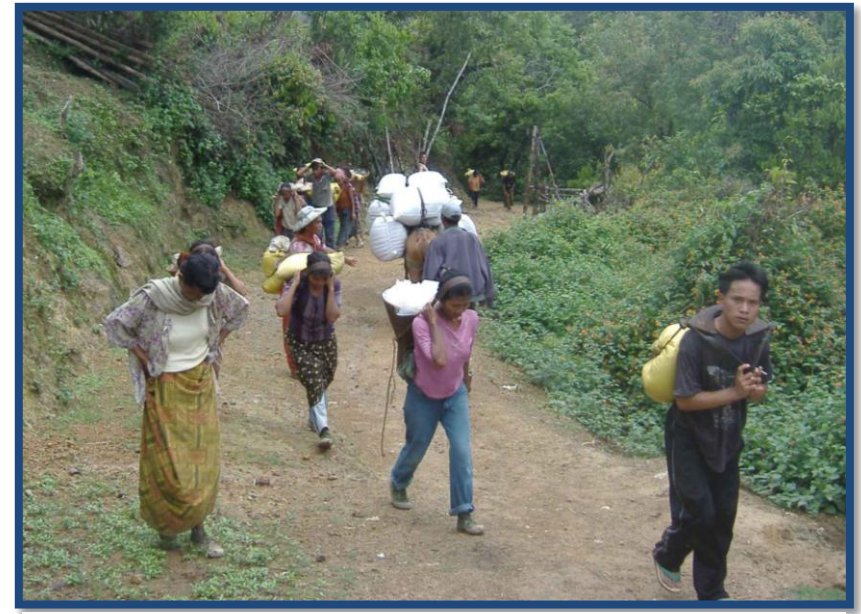
Chin villagers carrying food aid provided by community-based relief teams. Community-based relief teams have been supplying necessary aid to remote villages unreached by international aid organizations.

While the WFP and the work of its coordinating partners is commendable, bringing much comfort and relief to affected communities with little resources or access alternative means, its programs have not been implemented without obstacles tribulations. In August 2008, villagers in Thantlang Township alleged that clerks in the Township Peace and Development Council, endowed responsibility with the preparing lists of eligible recipients for UNDP assistance, had deliberately removed the names of households that failed to perform forced labor for the