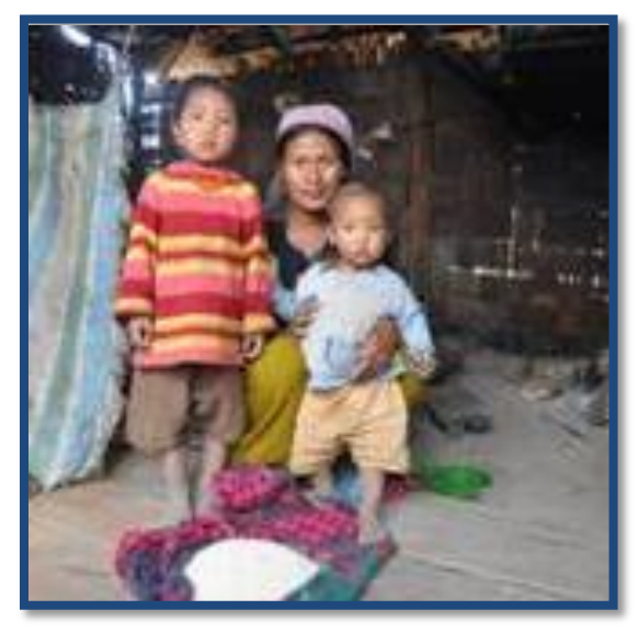
A single-parent mother with all the food her family has left; between one to two days supply of rice.

Poor weather has further hampered cultivation efforts in Chin State. Low rainfall in some areas, such as Thantlang Township, has dried out paddy stalks and forced farmers to re-sow their fields several times during the planting season. Farmers in wet farmlands have had to put plowing on hold until sufficient water reserves are available. While inadequate rainfall was blamed for poor harvests in Thantlang Township, overly abundant rainfall in parts of Matupi Township caused the over-ripening and rotting of rice paddy and maize fields. 16