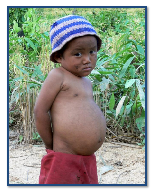
Child suffering from worms and malnutrition, common health problems in Chin State. Children are particularly at risk of malnourishment due to food shortages.

person in his village is suffering from diarrhea.<sup>58</sup> At the time of writing, more than 54 people have reportedly died due to diseases, illnesses, and complications related to the food crisis.<sup>59</sup>