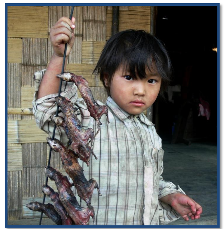
Chin child holding skewer of rats. The SPDC has yet to provide food aid or assistance to hungry villagers struggling with severe food shortages in Chin State.

Far from enjoying self-sufficiency, many affected communities in Chin State are completely dependent on foreign aid for their survival. Ignoring the severity of the food crisis, the SPDC issued orders in the first week of July through the Town Peace and Development Councils prohibiting receipt of foreign assistance or relief in Chin State. Baccording to the order, those who receive foreign assistance will be considered opposed to the government and subject to scrutiny. Scrutiny, as practiced by the SPDC in