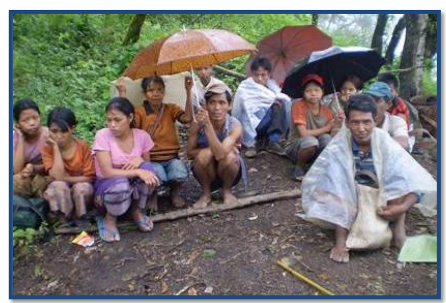
members as they are forced to Chin villagers journey long distances to reach the India-Burma border in order to take on added responsibilities acquire rice.

difficult to find in Mizoram and Chin are often relegated to informal sectors that are physically strenuous, lowand paying, sometimes dangerous, such as road construction, digging toilets, clearing farmland, or cutting forest wood. The money received for this work is nominal, and at times barely enough to survive in India, let alone build a savings to send to Burma. Meanwhile, families and villages left behind in Burma struggle with the loss of family community take on added responsibilities of those who have departed.