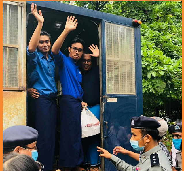
Sentences for Three Members of Peacock Generation