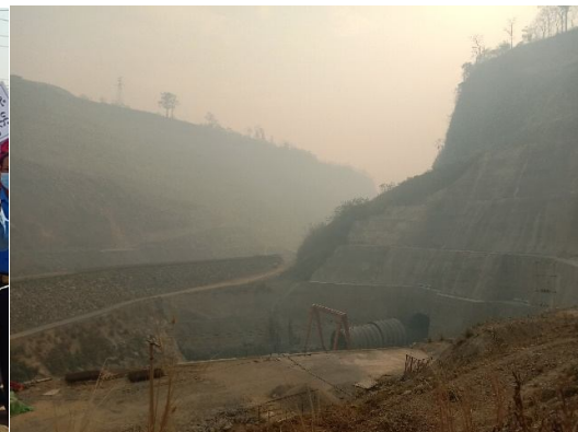
No visible work activity at Upper Yeywa dam site, April 3, 2021