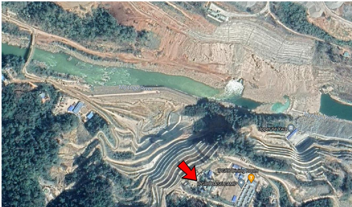
Google satellite image of Upper Yeywa dam-site with "IPGRB BASE CAMP" label

Since the military coup on February 1, anti-coup protests have taken place in towns near the Upper Yeywa dam site, including Kyaukme and Hsipaw. On February 17, workers from the Upper Yeywa dam site joined the protests in Kyaukme, holding a banner saying “Upper Yeywa Hydropower Project Civil Disobedience Movement.” They were not seen joining any public protests after this date, but the sound of pot-banging in support of the CDM movement has been heard from the dam site in the evenings. Construction work at the dam site appears to have almost completely stopped.