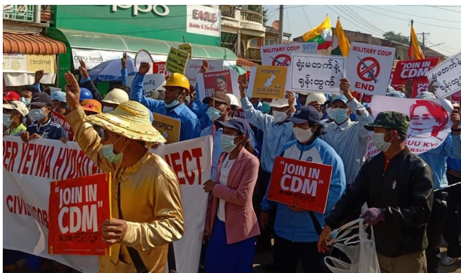
CDM protest in Kyaukme town on February 17, 2021

Since the military coup on February 1, anti-coup protests have taken place in towns near the Upper Yeywa dam site, including Kyaukme and Hsipaw. On February 17, workers from the Upper Yeywa dam site joined the protests in Kyaukme, holding a banner saying “Upper Yeywa Hydropower Project Civil Disobedience Movement.” They were not seen joining any public protests after this date, but the sound of pot-banging in support of the CDM movement has been heard from the dam site in the evenings. Construction work at the dam site appears to have almost completely stopped.