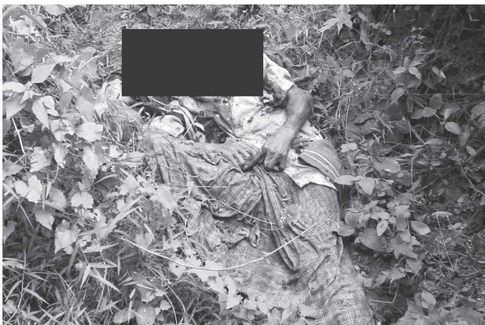
Shan man tortured and killed by Burmese army in Nam San Yang village

The negative effects of torture are not limited to the individual. Family members of the tortured victim must also deal with their loved one's traumatic experience and often feel resentment and mistrust of the authorities responsible. They may also