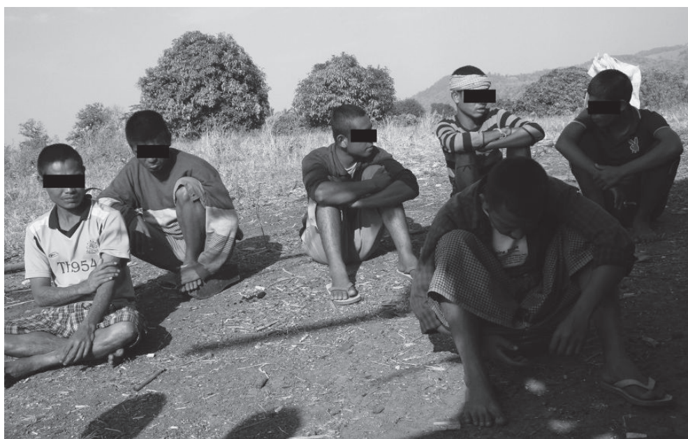
Prisoners forced to be porters that fled post-election day fighting between DKBA and government troops, Karen State 2010

Civilians in ethnic conflict areas who are forced to serve as porters for the Burma Army are generally at the mercy of troops and subjected to multiple forms of torture, both physical and psychological. One form of torture that causes severe