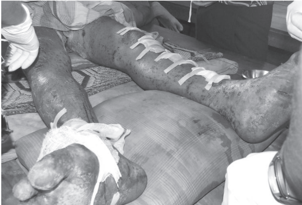
A porter tortured by the government troops in Karen State

which generally takes place in isolated rural areas, especially those in conflict areas, “where the military continues to routinely force civilians into carrying supplies or providing labor for a range of military related duties.” 38 The Burma army has also used prison convicts as porters in armed conflict zones, a practice that has been documented by Human Rights Watch, the Karen Human Rights Group, the United Nations, the International Committee of the Red Cross (ICRC), and Amnesty International. 39 In addition, threats, harassment and violence are often employed by authorities that forcibly recruit laborers, often leading to the use of torture and ill treatment to punish those who are disobedient or too weak to fulfill their duties.