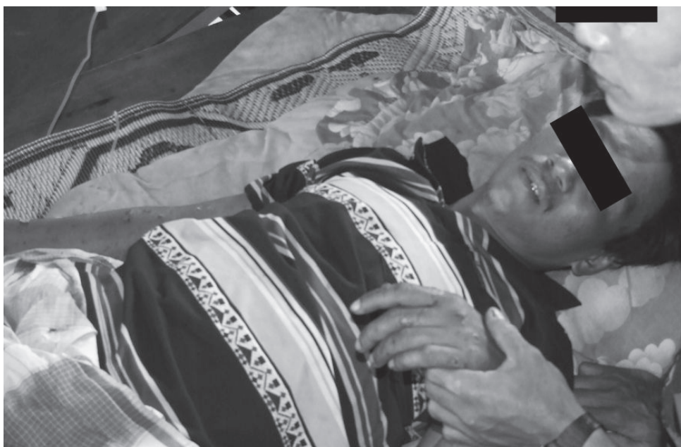
A forced porter receives medical treatment after being tortured by government troops

[A] Burmese Army column, which came from Myaing Thar Yar and Thet Kel village, arrested me [for portering]...On that day, I was sick...and [was] lying on the bed in my hut when I was arrested... They also arrested people, both women and men, from Myaing Thar Yar. There was total of 15 people...The commander told us [that he would] release all of [us] when we reached the next village. However, we didn't believe what he said. I have been arrested as a porter many times in my life...One soldier ordered me to carry about 40 kilos of ammunition. I felt pain on my shoulders because of the [small] rope, which tied a bamboo-basket. I had to walk like a soldier [and] we had to cover these soldiers. If a gun battle broke out, we would be hurt for sure...Burmese soldiers scolded