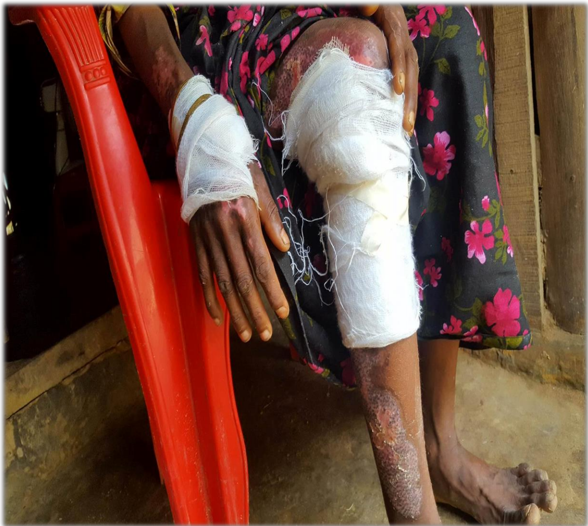
fourth rape victim with leg injuries

The victim had burn wounds to large parts of her body which she said she suffered when she was playing dead near bodies that were being immolated.