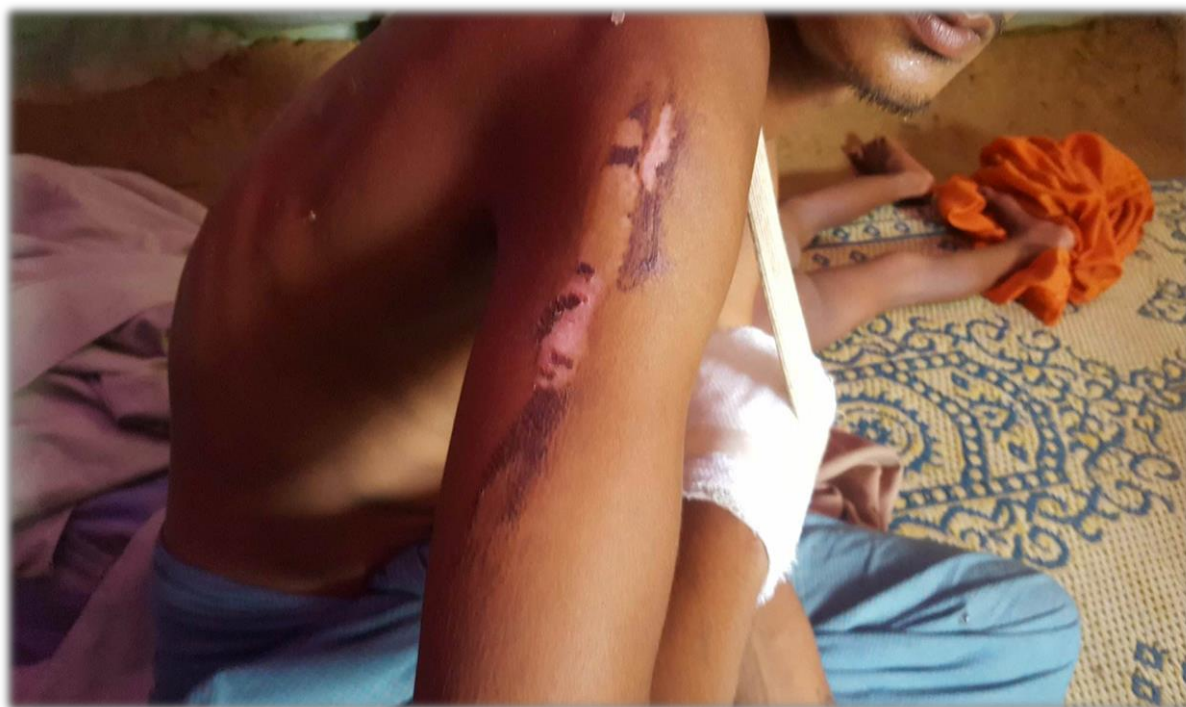
25-year-old landmine victim

“It took one day to come to Bangladesh [from my village],” he said. “I came here because of Rakhine mobs, security forces and military attacked us, shot us, stabbed us, burning down our houses. The military raped the mothers and sisters at night. Our houses were burned to ash. These are the reasons why we fled.”