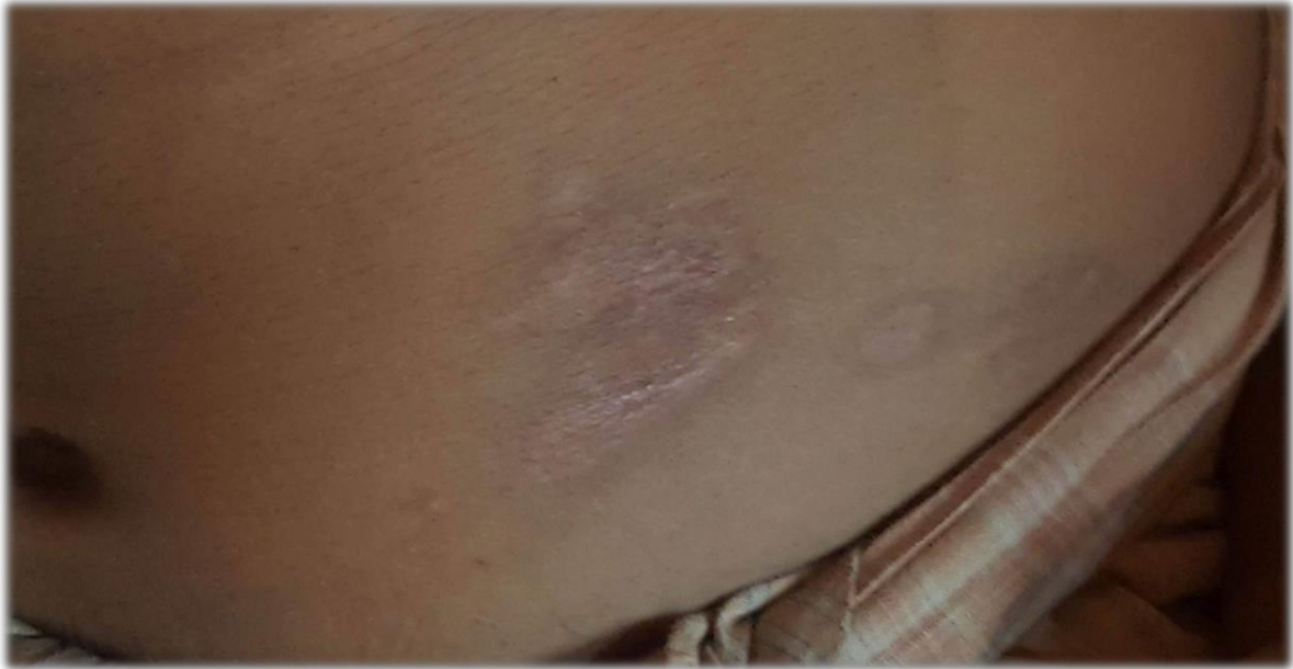
11 old victim with a graze

“I was also shot in my leg. I was treated in Bangladesh.”