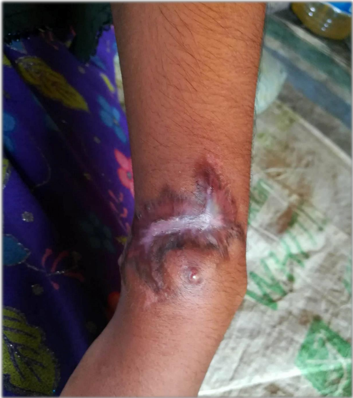
the 21-year-old victim with wounds to her arm

She fled and hid in a paddy field, she told BROUK. "Two hundred or more people were laying down, hiding from the bullets there," she recalled.