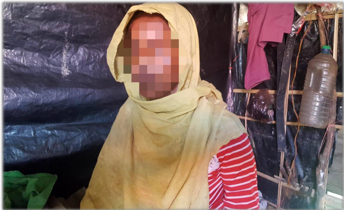
third rape victim

“Three military men came to the front of my house,” before they raped her, she recalled. “People everywhere were fleeing with children because of the shooting and stabbing. The military-led my children to run away but stopped me, took me inside my house and raped me.”