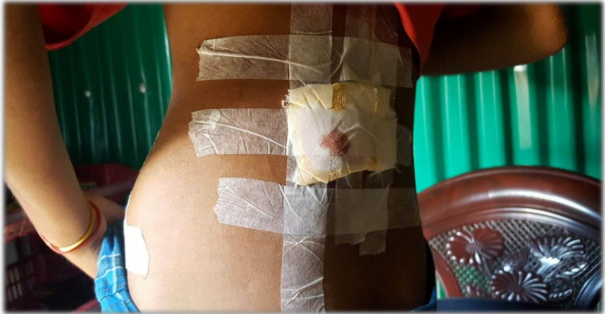
12-year-old victim displaying back injury

When asked if he had any connections to ARSA, he replied: “I heard the name ARSA but I don’t know anyone from the group. “