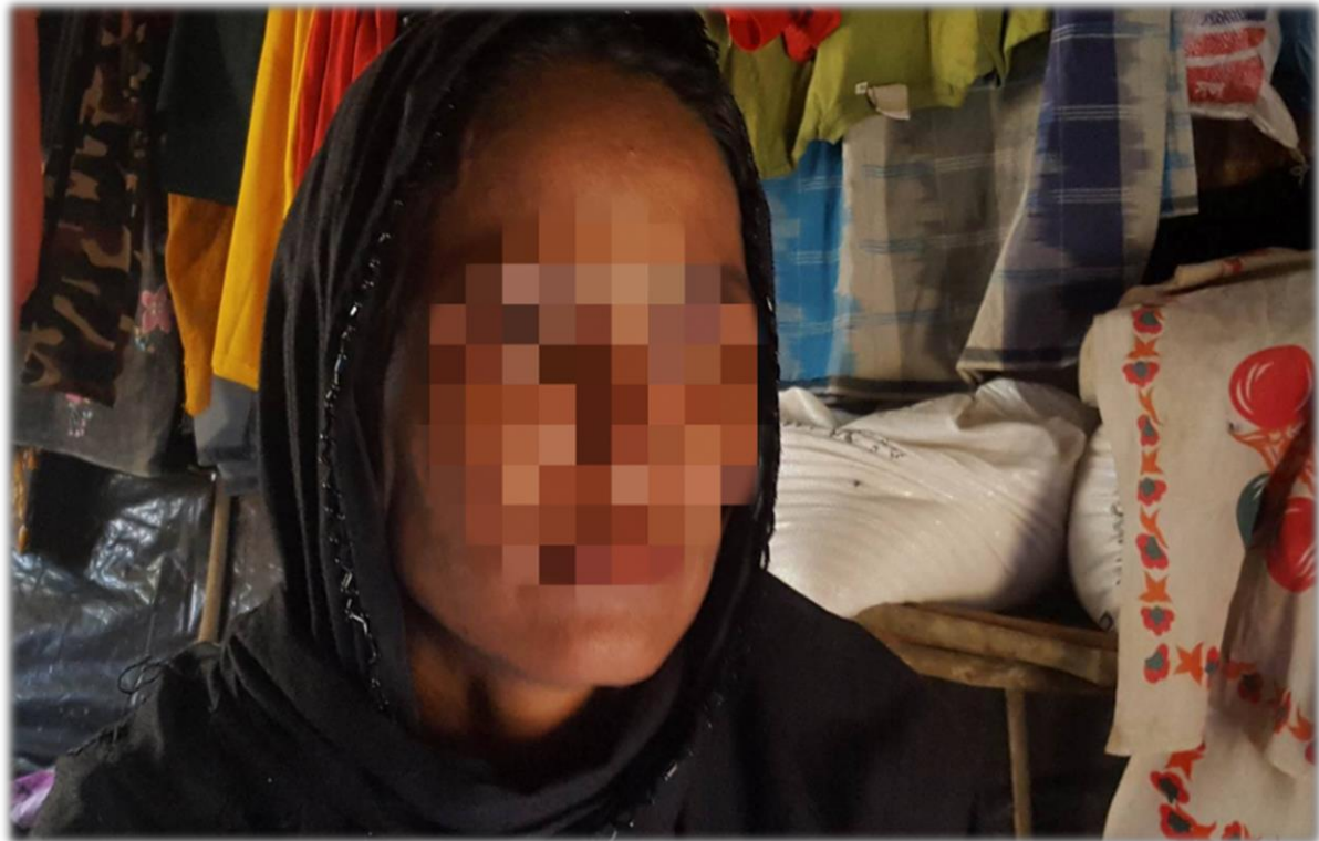
first rape victim

Describing her own abuse, the source said “the military came to our village around midnight. Three military men came to my house; one of them entered the house with a gun while the other two waited in front of the gate.”