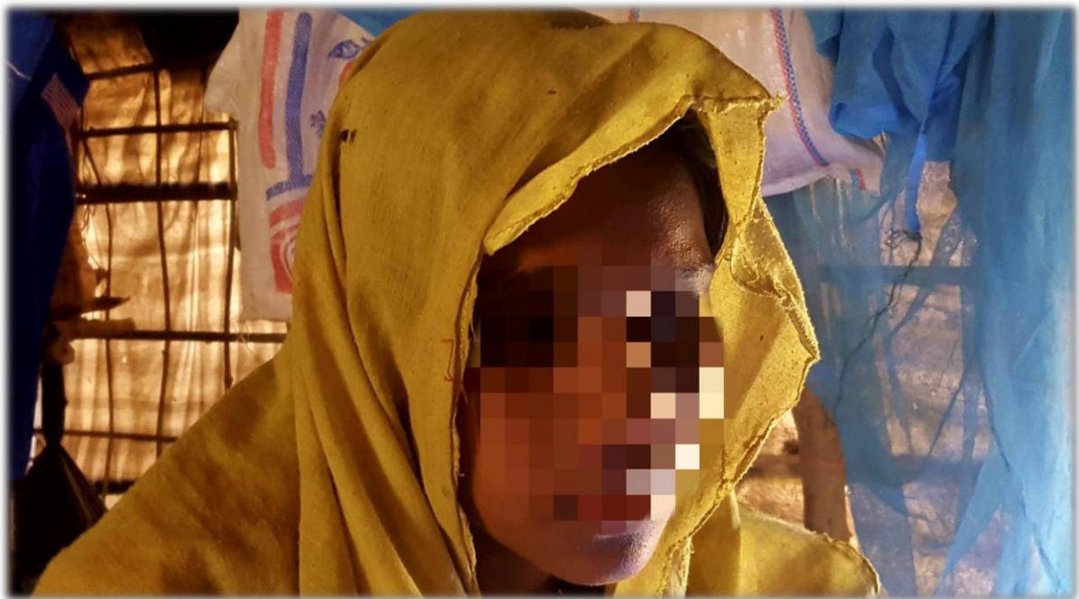
second rape victim

“A group of military men stopped me trying to leave the village. One of them took me inside my house and raped me,” she recalled. “Another soldier held my baby. When I managed to struggle free, I took my baby and ran,” she said.