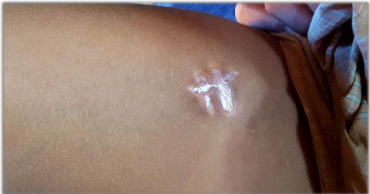
the 11-year-old victim with a bullet wound

BROUK has spoken to an organisation that confirmed it operated on the wound on his leg, which they identified as a gunshot injury.