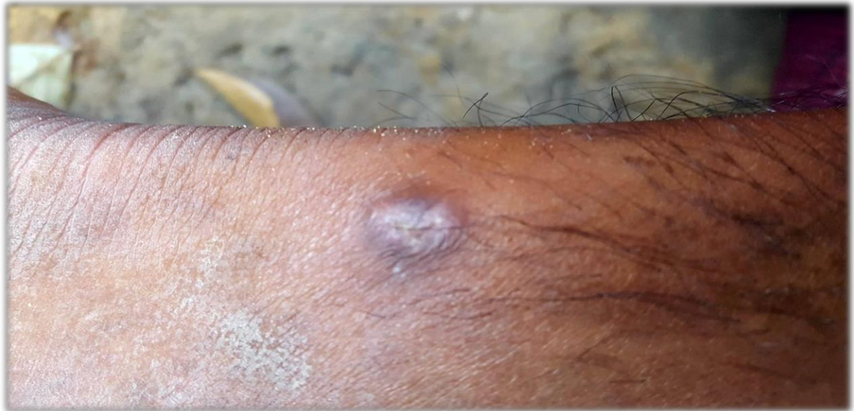
the 21-year-old victim with wound at the ankle

A doctor who reviewed the photograph above told BROUK that it appeared to be "arm scarring from a bullet graze wound with friction burns, likely from joint being bent when the bullet grazed the skin."