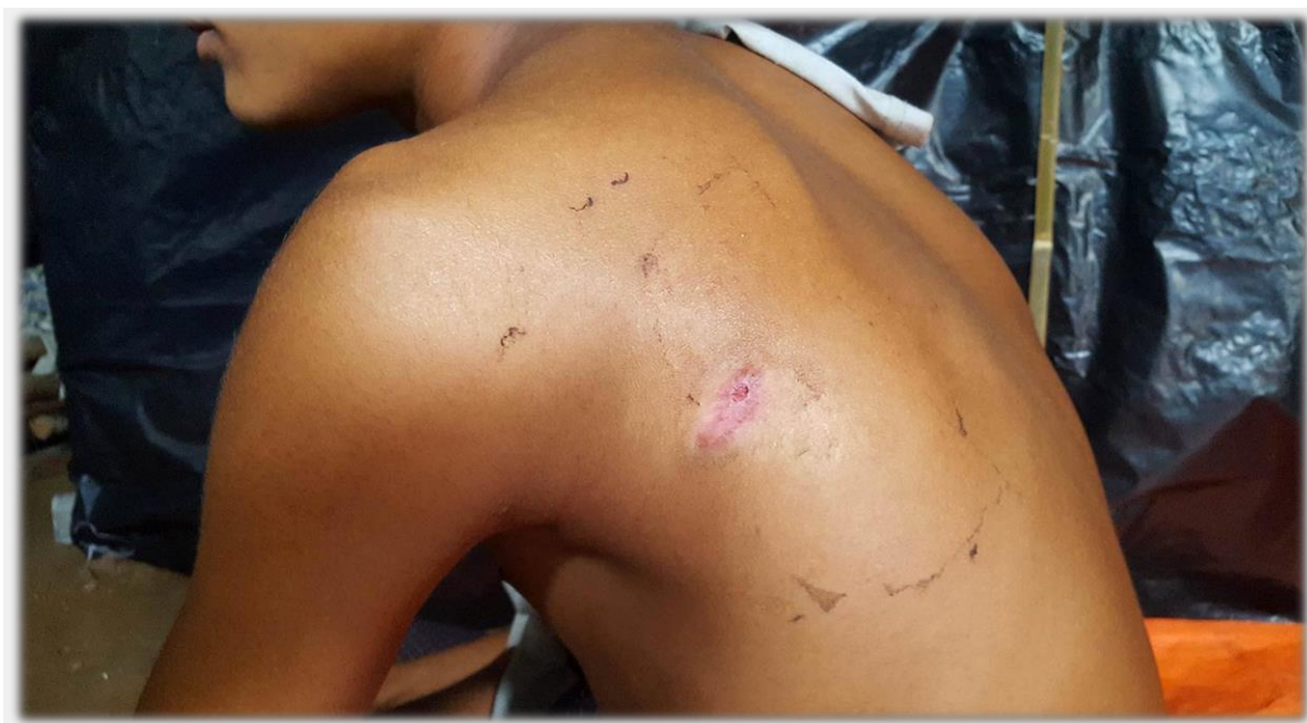
16-year-old victim with a gunshot wound on his shoulder

BROUK has been in contact with the team who treated him who confirmed he was shot with a bullet in the back. A doctor who spoke on condition of anonymity referred to the wound as a typical “bullet graze and entrance wound.”