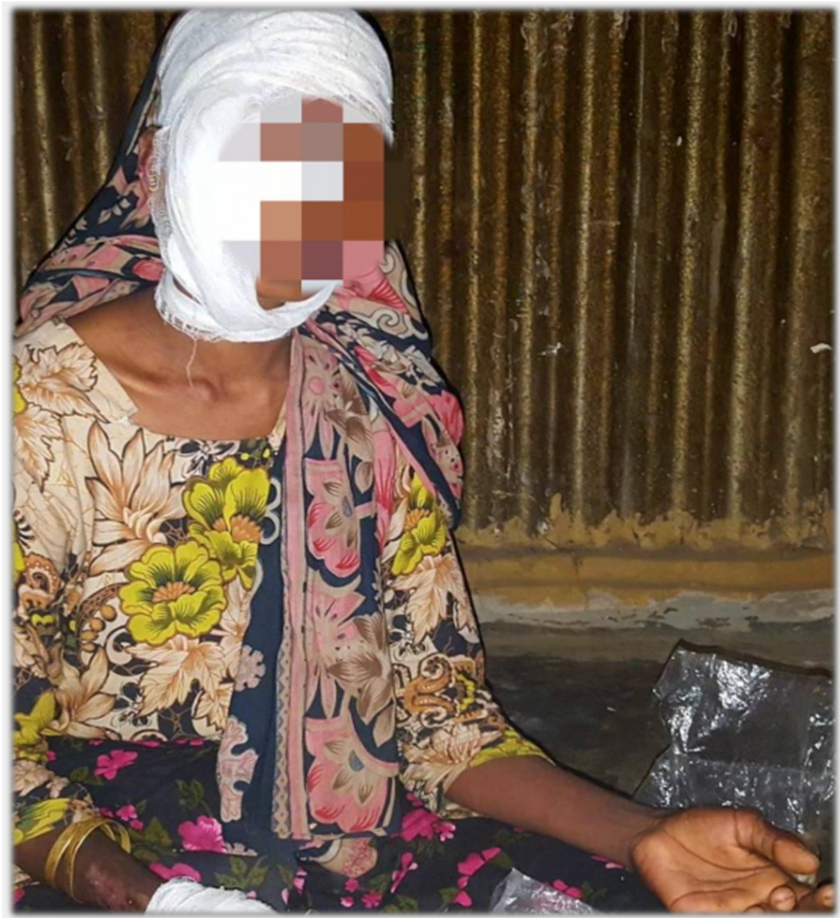
Fourth rape victim

“All the women sat near the river bank. And from there, the military took five of us and beat them. And then they stabbed to death those who were still alive,” she continued.