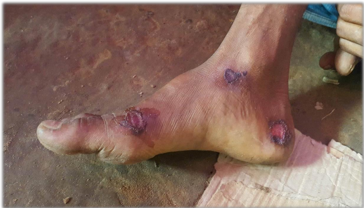
foot injuries in landmine victim

Continuing, he added: “A man was walking in front of me with a buffalo. The buffalo stepped on the mine and the mine flew in the air and fell far away. There was flame everywhere even though it was dark at the time. Many sparks and fragments struck me and I collapsed. I was unconscious for a time. When I came to, I realised that I had been brought to Bangladesh. My brothers took me to hospital. I feel better now.”