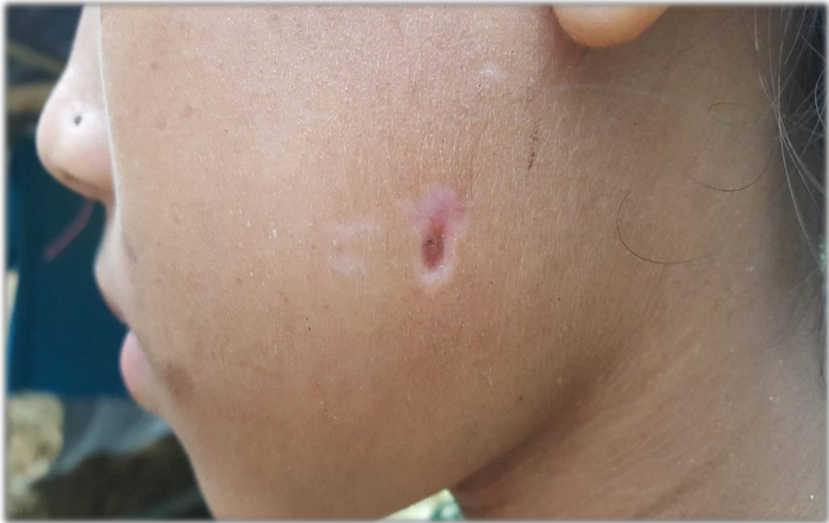
the 12-year-old victim with cheek wound

"I was shot in my house by a military bullet," she said. "At that time, the military seized the village and shot at people. When I was shot, I fell unconscious. I got treatment here [in Bangladesh] and in Myanmar."