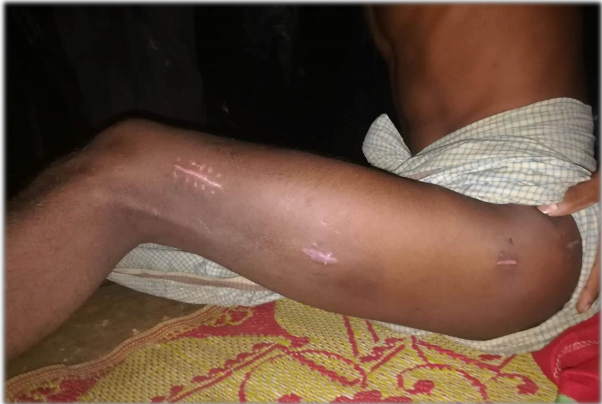
23-year-old victim displaying leg wounds

The wound in the first photo “appears to be around bullet or hot shrapnel entrance wound crossed by an incision,” alongside “four suture wounds”, according to a doctor who examined the image.