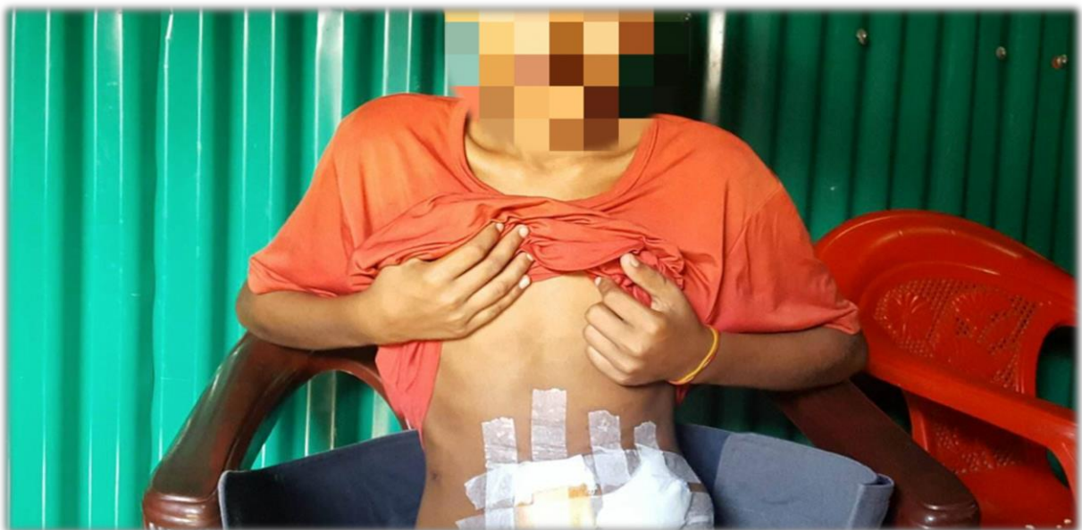
12-year-old victim displaying injuries from front

BROUK was able to make contact with the medics who treated the boy for his bullet injury, who confirmed he was shot.