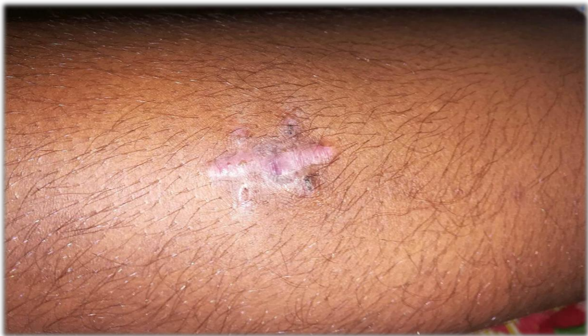
a 23-year-old man with a bullet injury in leg

Photographs of his wounds are displayed below.