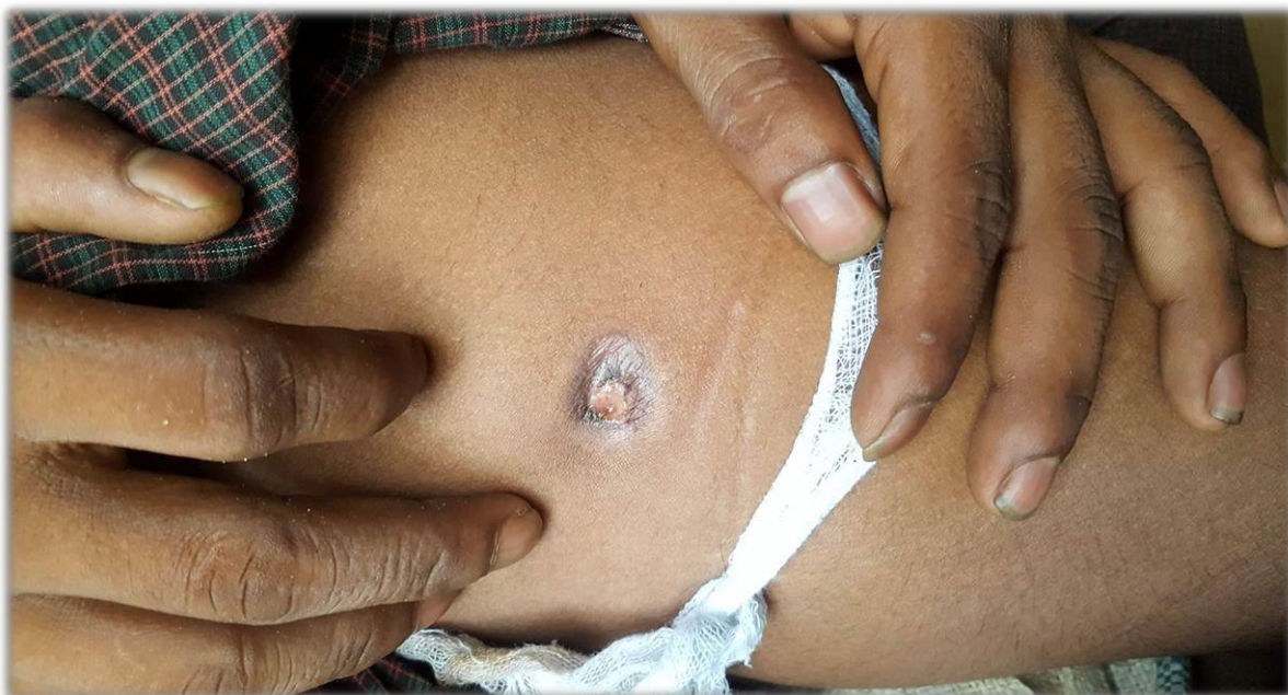
15-year-old victim with a gunshot wound

A twelve-year-old boy from Maungdaw Township told BROUK that he was shot by the military during an attack on his village in September. He arrived in Bangladesh later in that month.