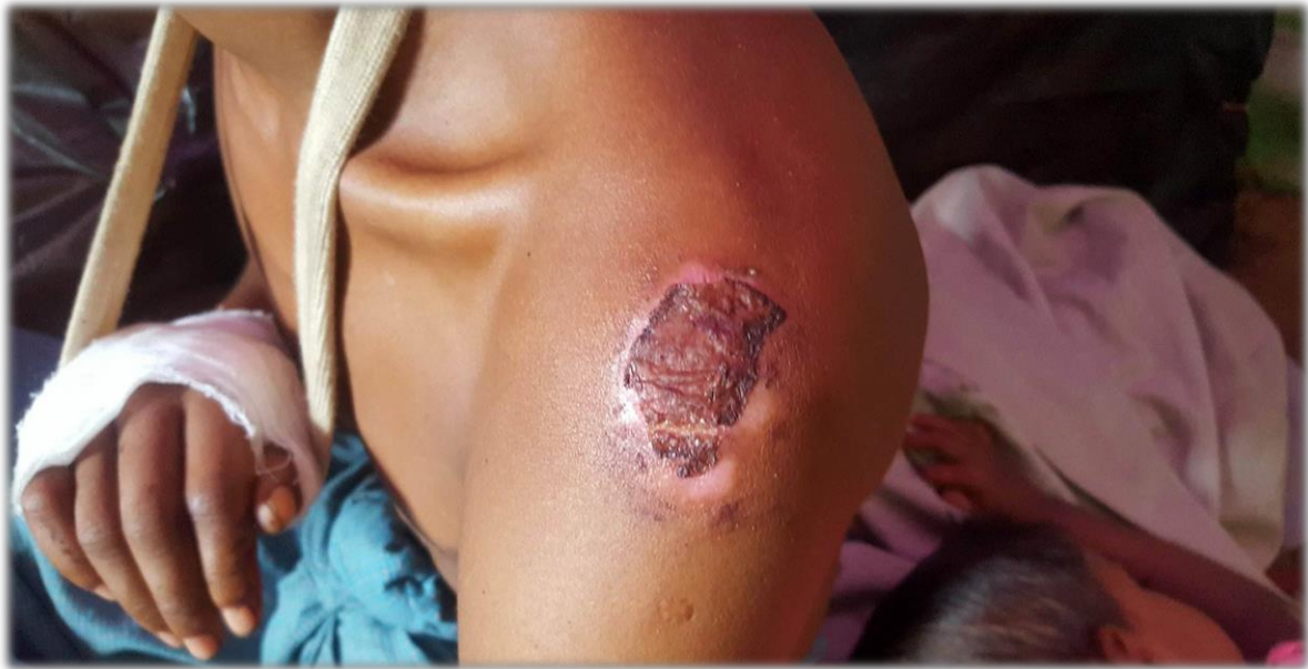
Shoulder injury to landmine victim

Regarding his other injuries, they observed that the leg wound looked like it was an “imprint injury” from the fragments of the mine, coupled with “burns from hot metal.”