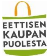
Eettisen Kaupan Puolesta (Eetti), Finland