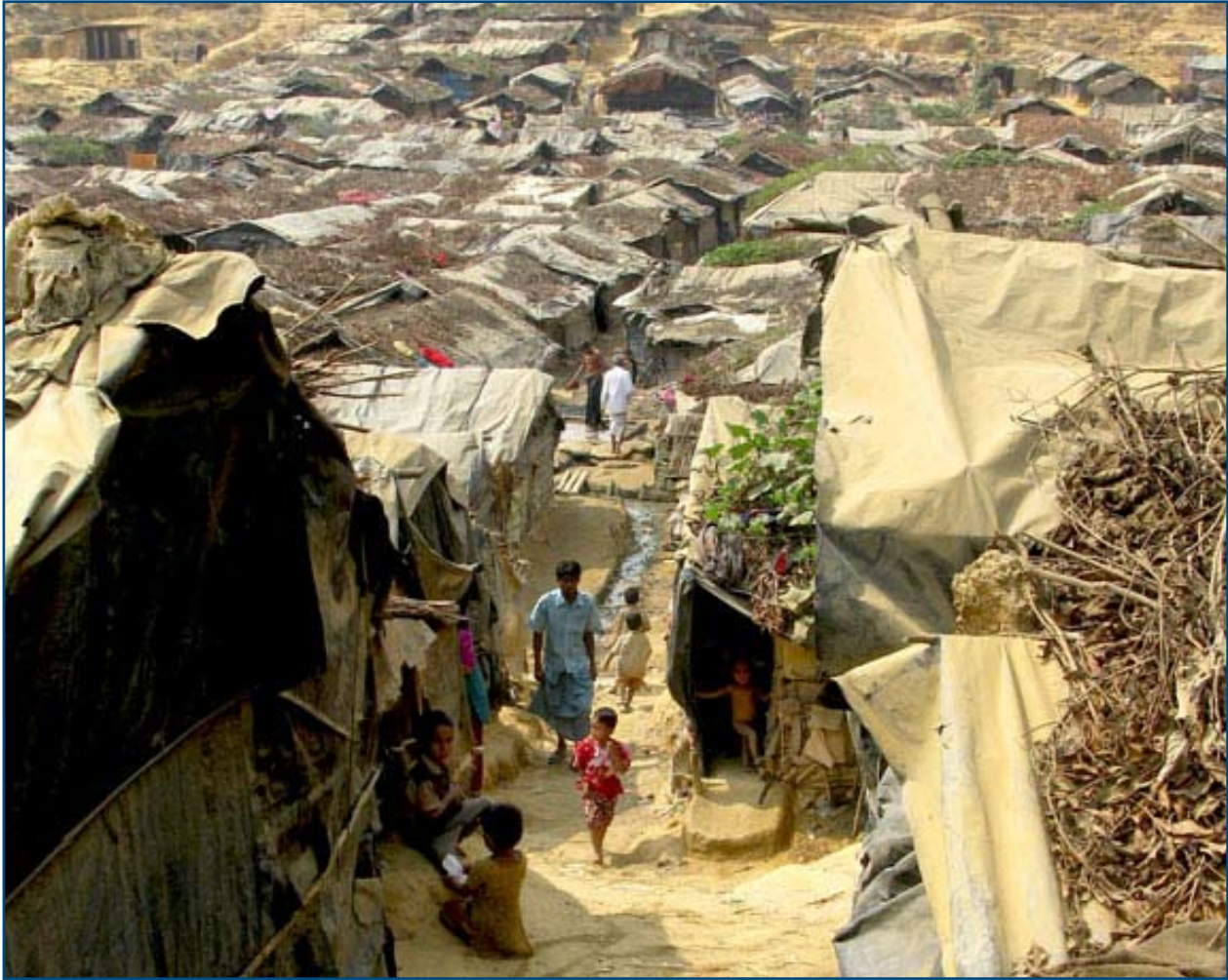
30,000 unregistered and unassisted Burmese refugees are effectively quarantined at Kutupalong makeshift camp in inhumane conditions without food.

Nayapara and Kutupalong camps collectively host 28,389 Rohingya refugees. 31 A number of other UN agencies and inter-governmental organizations operate projects inside the two official camps 32 where registered refugees have access to services common to most long-standing refugee settlements. Though registered refugees do not have the right to work, UNHCR has provided some livelihood training activities. 33 UNICEF provides primary school education as well as adult and adolescent literacy programs. A computer center in Nayapara camp allows residents to learn basic computer applications. The UN World Food Program provides food aid, and UNCHR recently began distributing a micronutrient supplement to children, pregnant women, and adolescent girls who are officially recognized