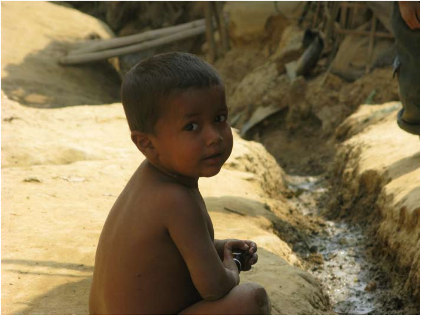
Rohingya children are forced to live beside open stagnant sewers at Kutupalong makeshift camp. PHR documents that 55% of children suffer from diarrhea due to unsanitary conditions.