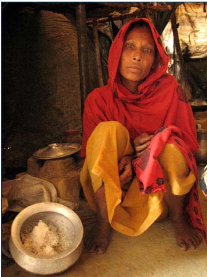
A 50-year-old refugee mother sitting beside a pot of rice that she got from begging – all the food her family of four will have for the entire day. Her husband was arrested by Bangladeshi police for stepping outside the makeshift camp at Kutupalong. She had not seen him in 15 days.

The PHR team encountered many children who met the clinical definition of kwashiorkor or severe protein malnutrition; however, due to security concerns and time constraints, diagnostic criteria such as edema were not systematically measured in all children.