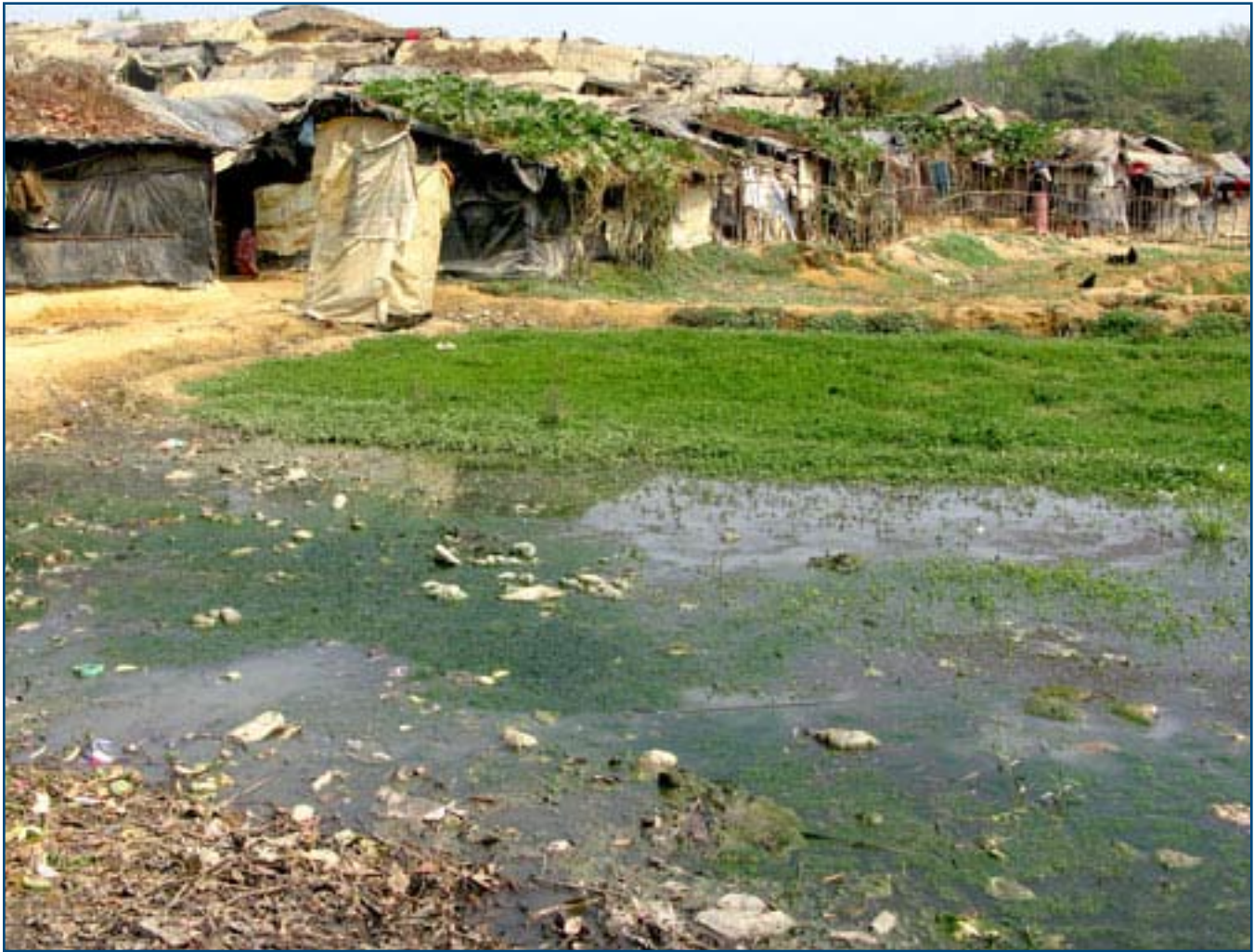
Human excrement and open sewers pervade the unofficial camp at Kutupalong, Bangladesh.