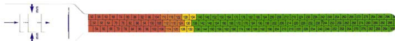
Figure 3 shows a mid-upper arm circumference (MUAC) colored plastic strip, which PHR investigators used to measure acute malnutrition in 143 children ages 6-59 months at the Kutupalong unofficial camp, near Cox's Bazar, Bangladesh.