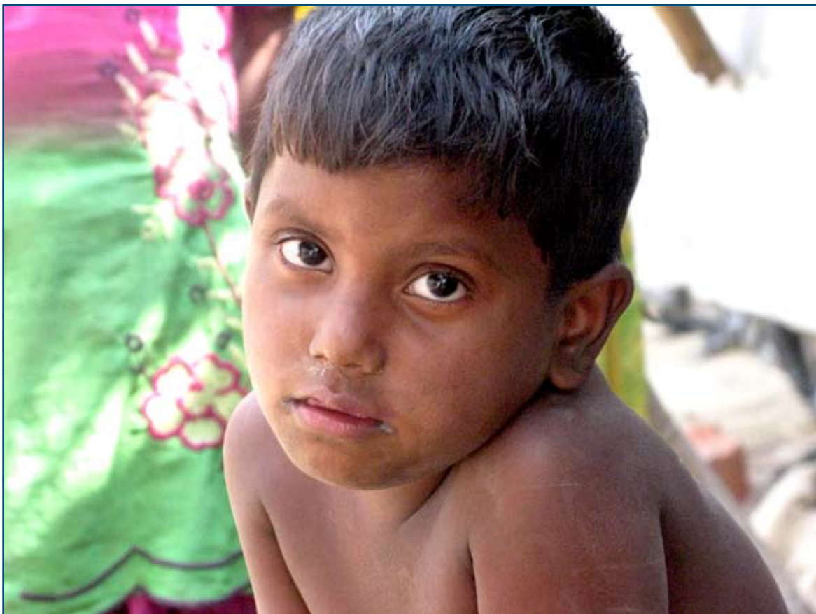
A young refugee boy at the unregistered Kutupalong camp, whose family has no food and is forced to borrow money at exorbitant interest rates. PHR's emergency assessment at the camp in February 2010 revealed that 91% of families had to borrow money and 82% had to borrow food over the last month in order to survive. The Bangladesh government strictly forbids international humanitarian groups from delivering food aid to this vulnerable and starving population.