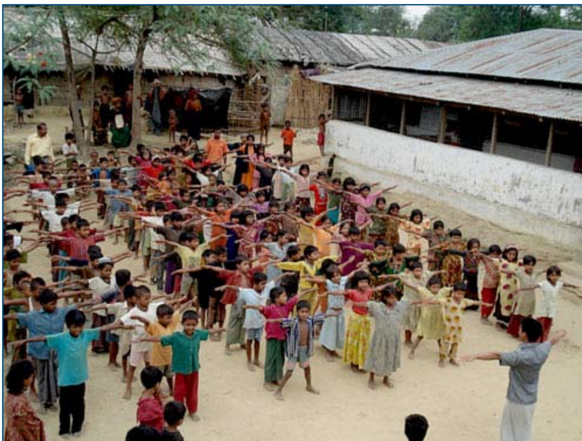
Registered Rohingya refugees at the official camp at Nayapara, Bangladesh receive education, humanitarian assistance, food aid, clean water, adequate sanitation, and shelter. They also enjoy protection from UNHCR, the United Nations refugee agency.