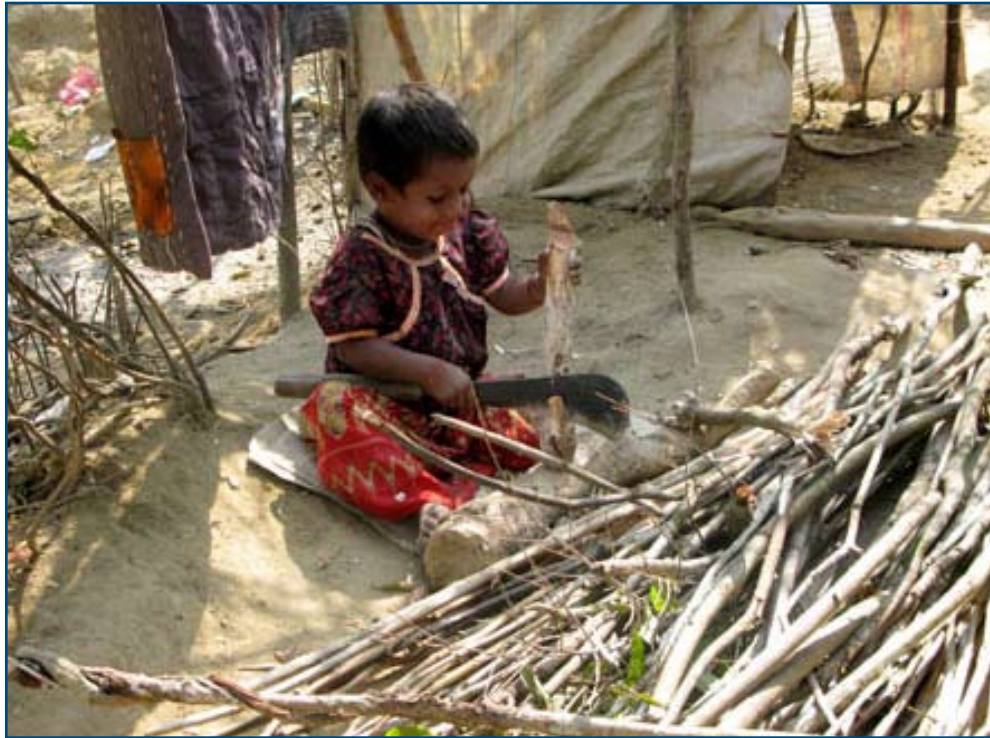
A young unregistered refugee girl at Kutupalong camp uses a machete for splitting firewood to sell – her family's only income.

days. Qualitative interviews in the camp reveal that families are forced to take out small loans – often from registered refugees in the nearby UNHCR-administered camps – with exorbitant interest rates.