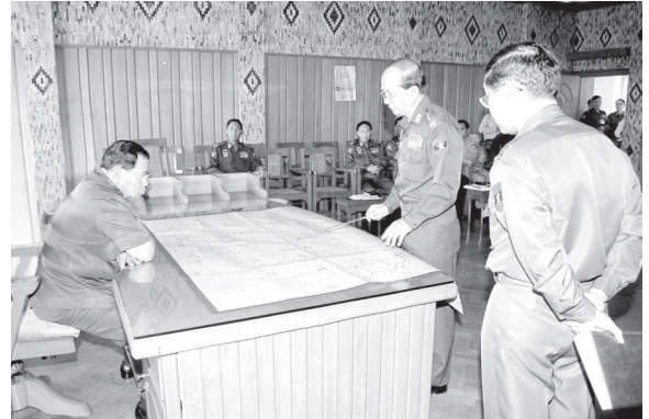
Their Sein briefing Than Shwe. Published in New Light of Myanmar.

More than 2,000 political prisoners are in jail in Burma. Many have been tortured, and are denied proper medical care. An estimated 55 political prisoners were released as a result of all prisoners having their sentences reduced by one year.