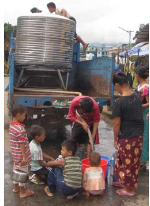
Truck delivering water to IDP camp.

Improved water and sanitation is needed in the camps, as are health education programs. In most camps the number of water points and latrines are insufficient for the number of IDPs, according to Sphere standards. Sphere recommends that the minimum distance from a household to a water point is less than 500 meters; that there is a maximum of 20 people for each toilet; that toilets are segregated by sex; and that children's feces are properly disposed of hygienically. 32 The crowded camp conditions with inadequate quality and quantity of water and inadequate sanitation places IDPs at increased risk for infectious diseases.