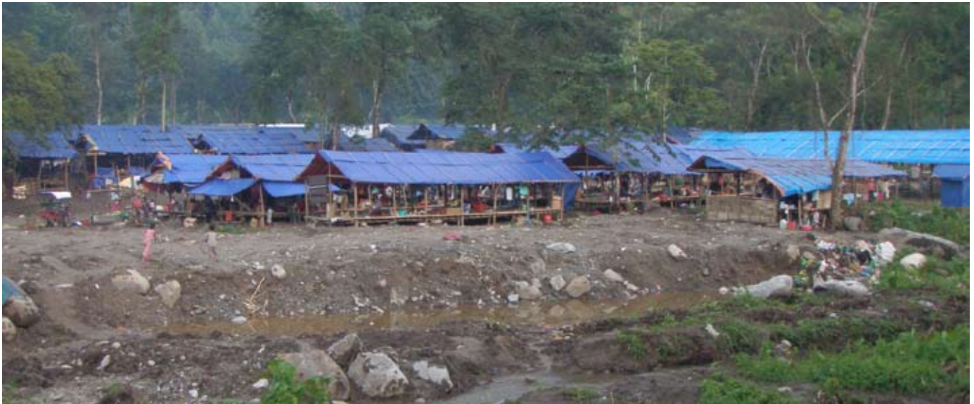
IDP camp, Kachin State.

Female storekeeper, 41, interviewed on 26 September, 2011