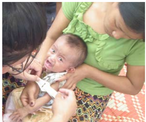
Child being measured for malnutrition.

MUAC measurements of 136 children surveyed in the Je Yang camp indicate that two percent of children suffer from severe acute malnutrition, which places them at exceptionally elevated risk of death. Another nine percent of children are moderately malnourished.