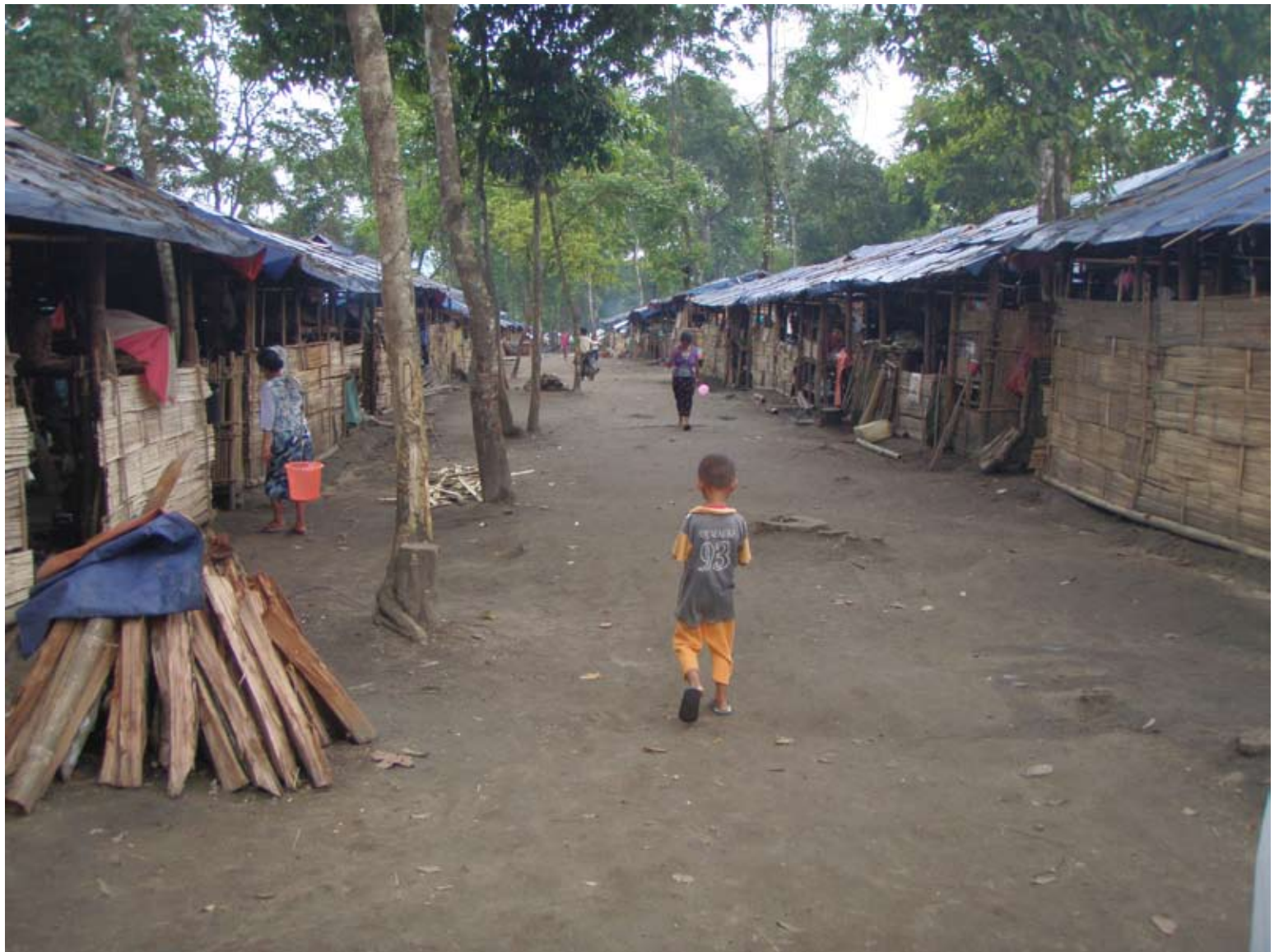
IDP camp, Kachin State, Burma.

“The problem is that everyone neglects this issue and says that it’s an internal problem—nobody wants to solve this problem. We suffer because of that. To solve this problem, the UN and US and EU or whoever, they should interfere in this situation. I would like to ask them to help us.”